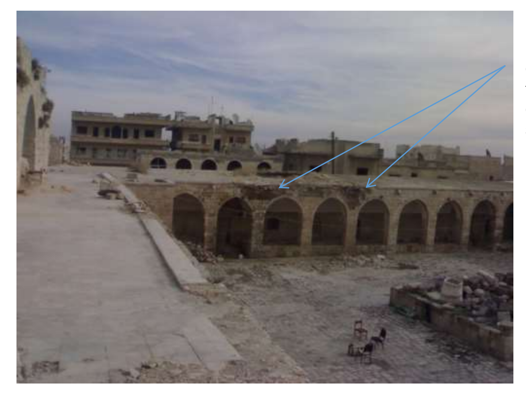
Partial collapse of the corridor on the east side

Partial collapse in the southeastern side of the second floor as a result of a missile.