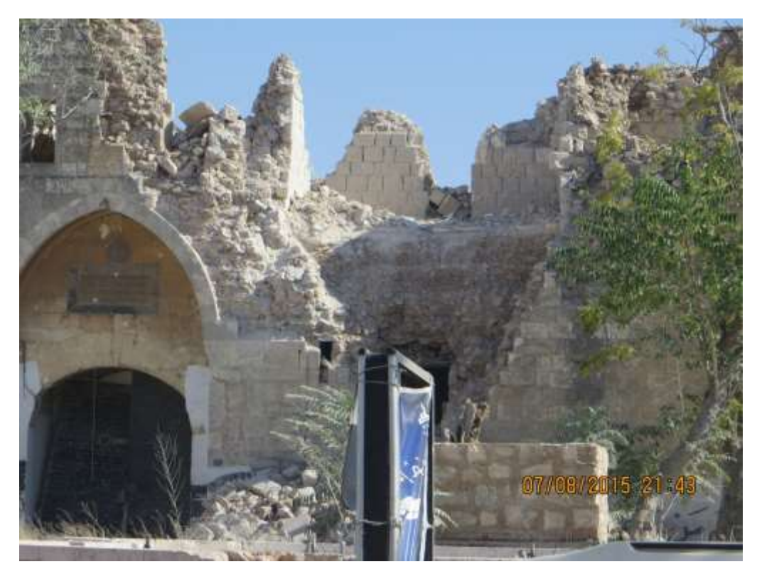
The main entrance from the northern side and the northern façade of the building, which was directly hit with a missile