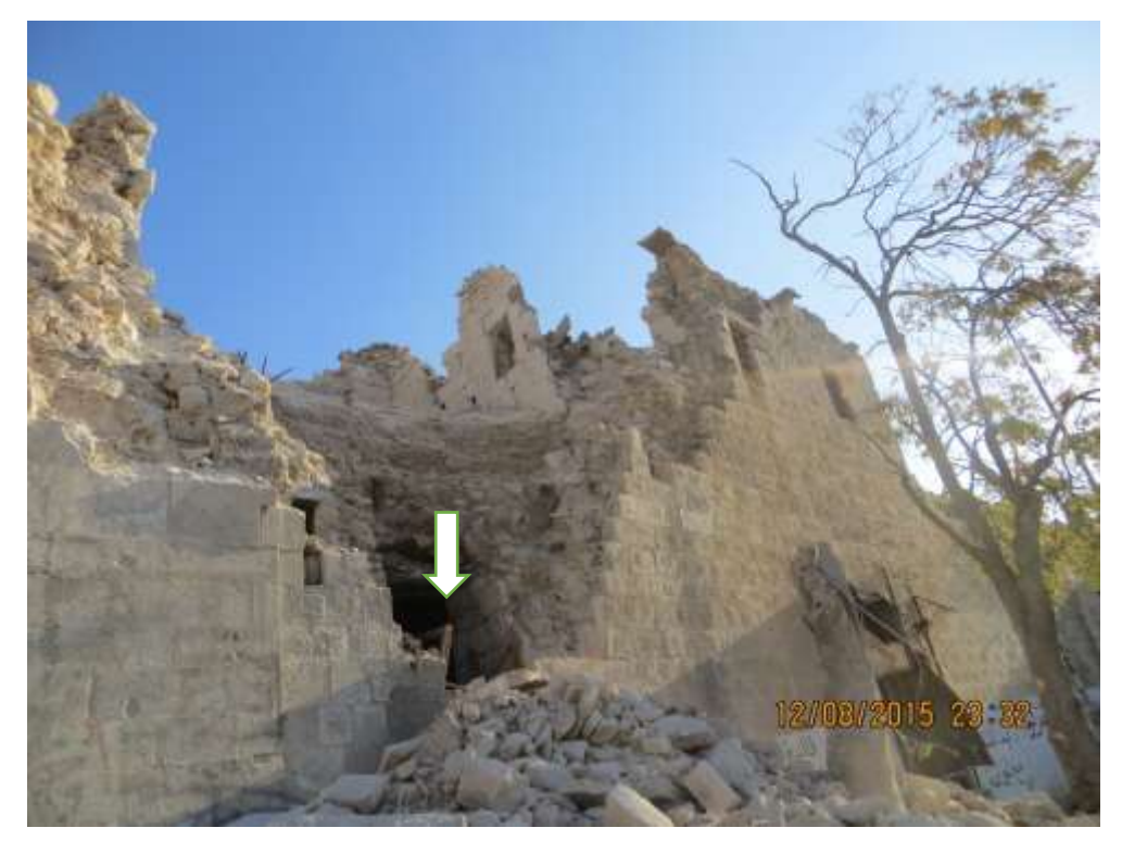
The northern façade of the Khan, after being hit with Airstrikes

A partial collapse in the northern side of the first floor created a large opening in the wall, as shown in the image below.