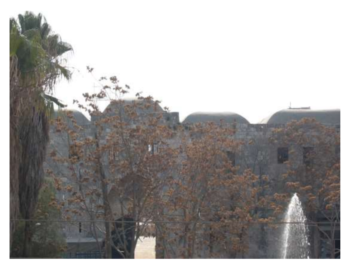
The northern façade of the building before the latest damage occurred