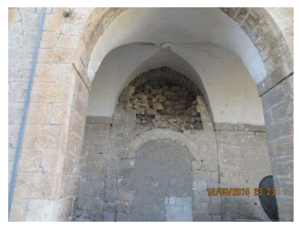
Partial collapse of the first wing as a result of an exploding barrel bomb landing near the Khan

Between 1/1/2014 and 8/7/2015, Khan Assa'ad Pasha suffered indirect damage caused by barrel bombs landing near the building. The damage to the walls includes partial collapse, cracks, and openings in the roof of the second floor (see photos below).