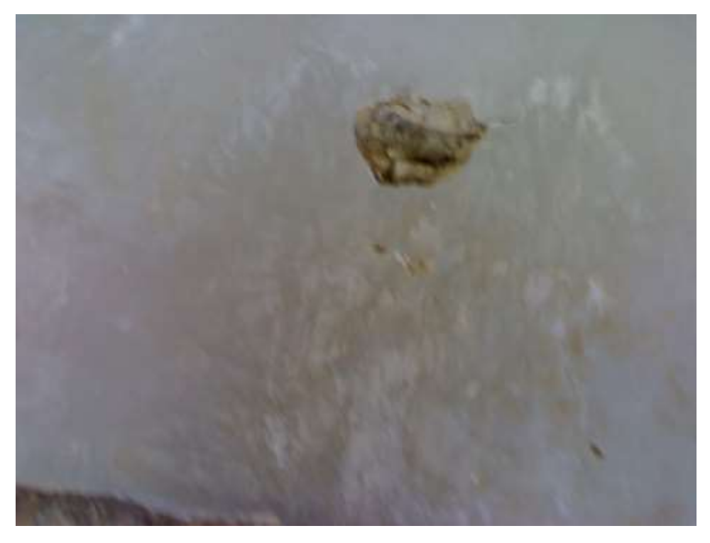
A partial opening in the roof

Between 1/1/2014 and 8/7/2015, Khan Assa'ad Pasha suffered indirect damage caused by barrel bombs landing near the building. The damage to the walls includes partial collapse, cracks, and openings in the roof of the second floor (see photos below).