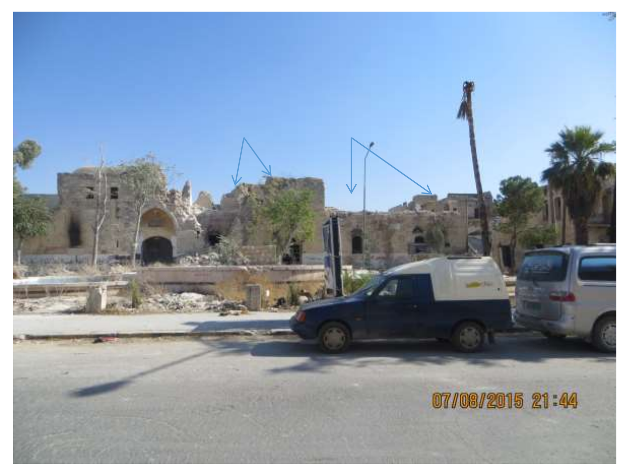
The north side of Khan Asa'ad Pasha after the latest regime airstrike