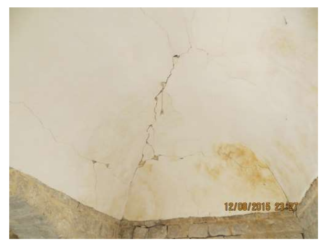
Cracks in the surviving section of the second floor that are a result of the explosion caused by the airstrike.