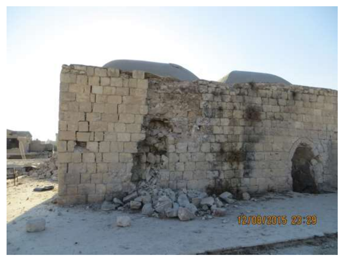
The eastern façade of the second floor showing partial collapse.