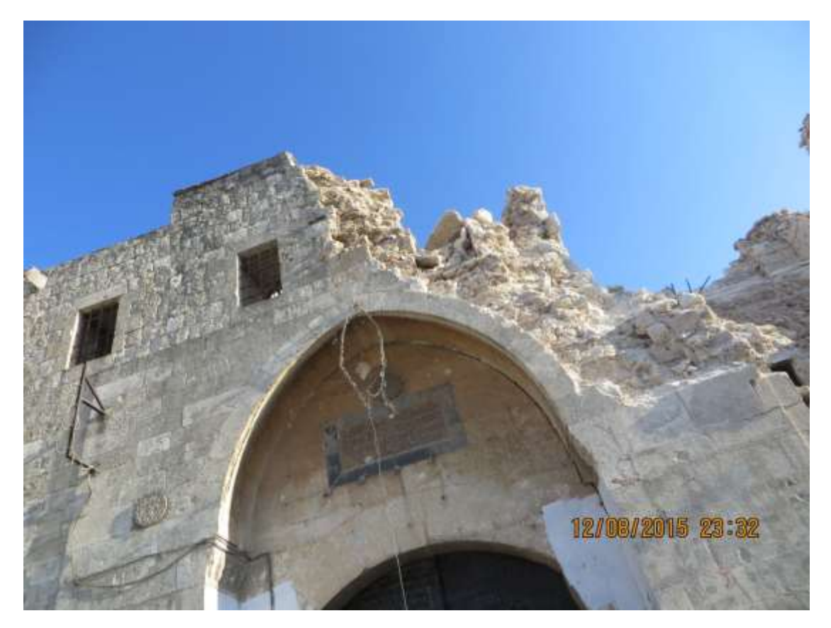
The north side of the second floor showing damage following the latest airstrike