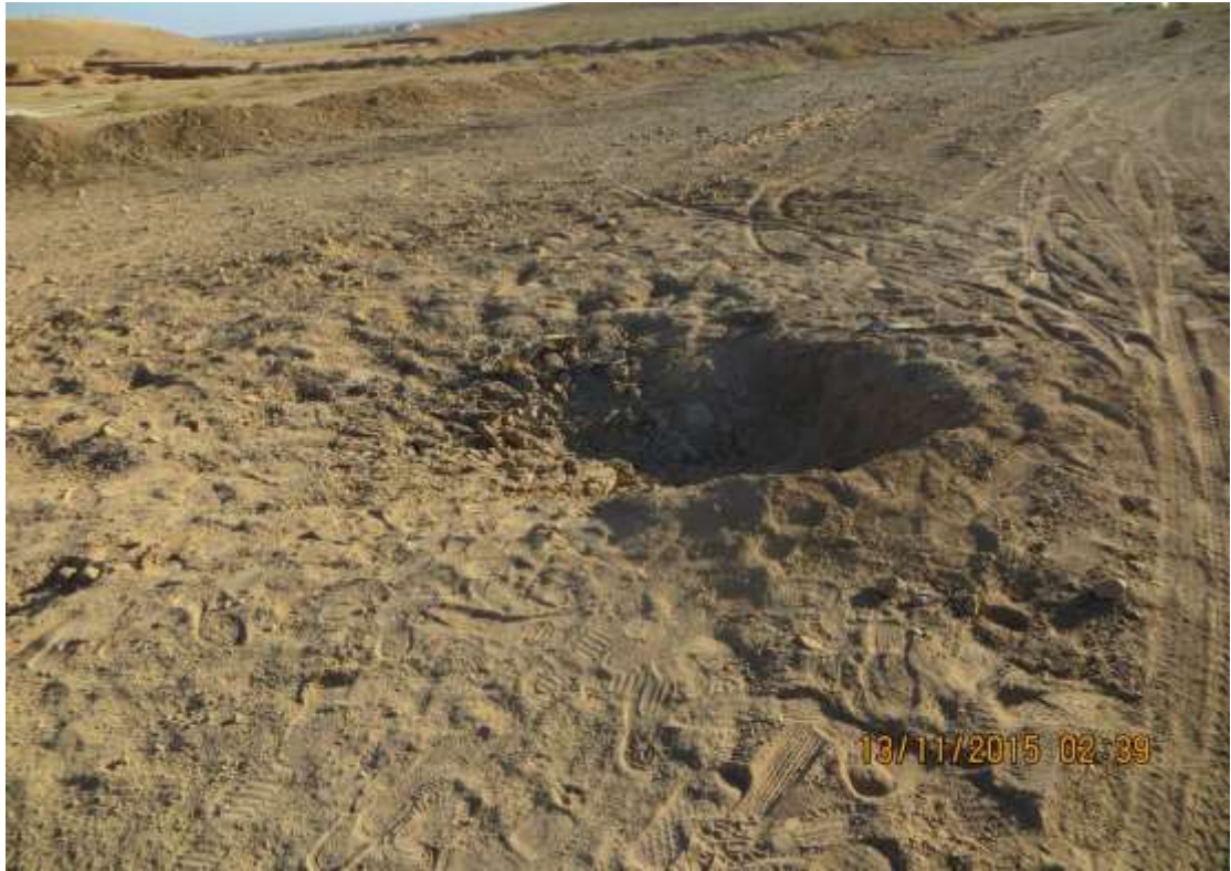
Large hole left by the Russian airstrike on the eastern slope.