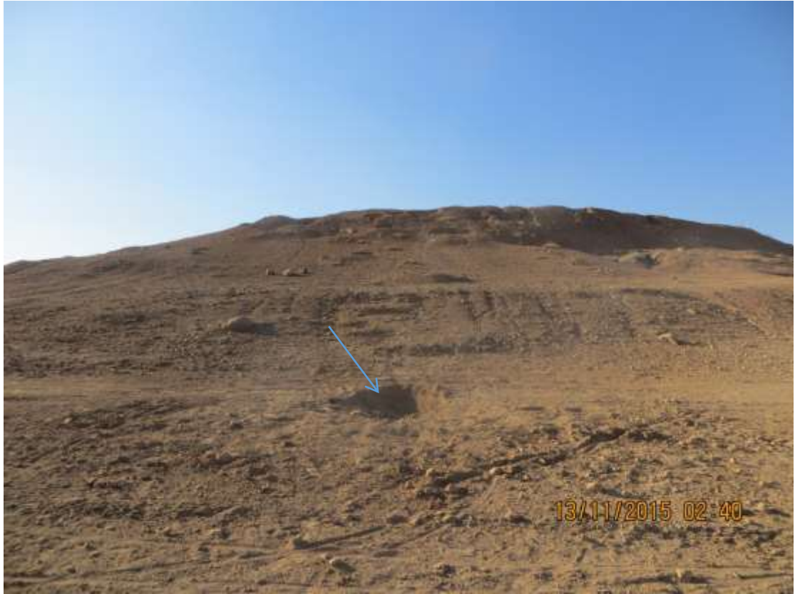
The eastern slope.