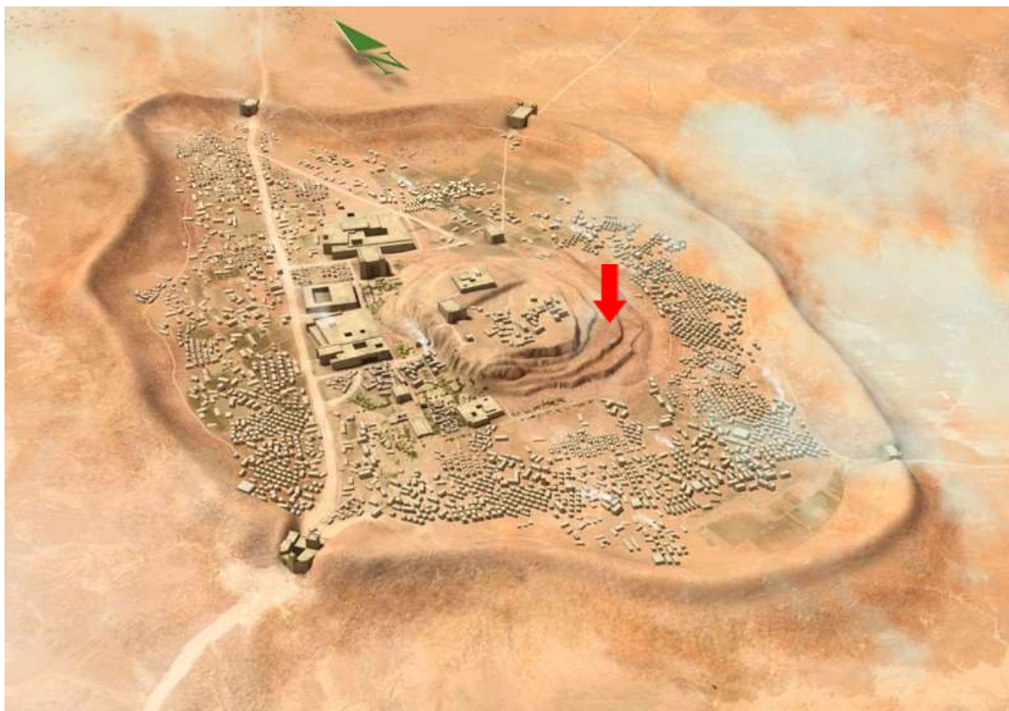
The eastern slope showing location of the Russian airstrike