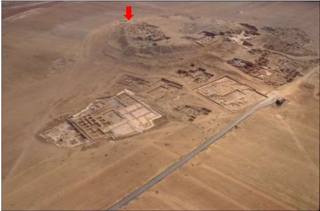
The eastern slope showing location of Russian airstrike.