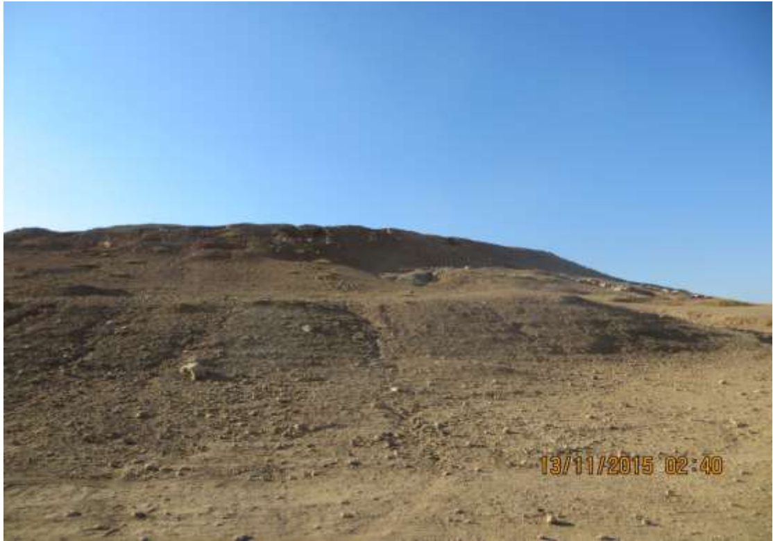
The eastern slope of the acropolis.