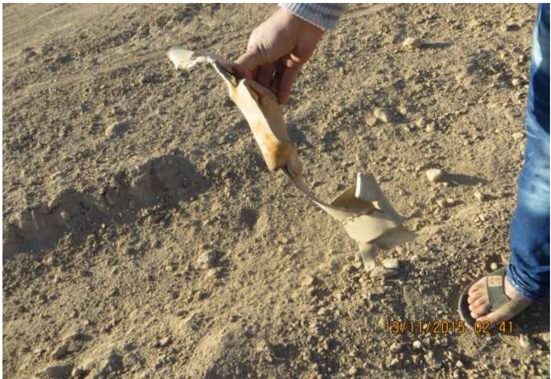
Remnants of Russian rocket