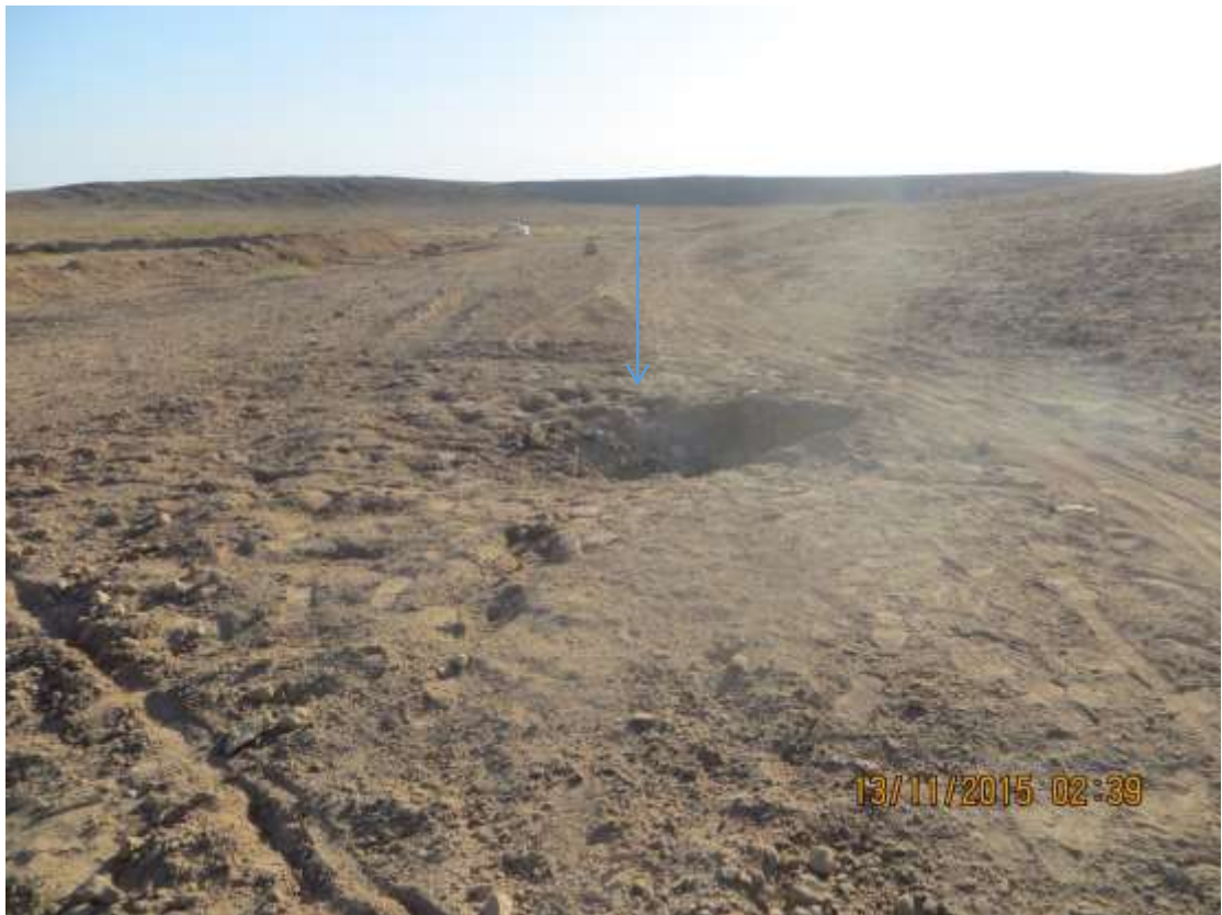
The eastern slope showing damage from the Russian airstrike.