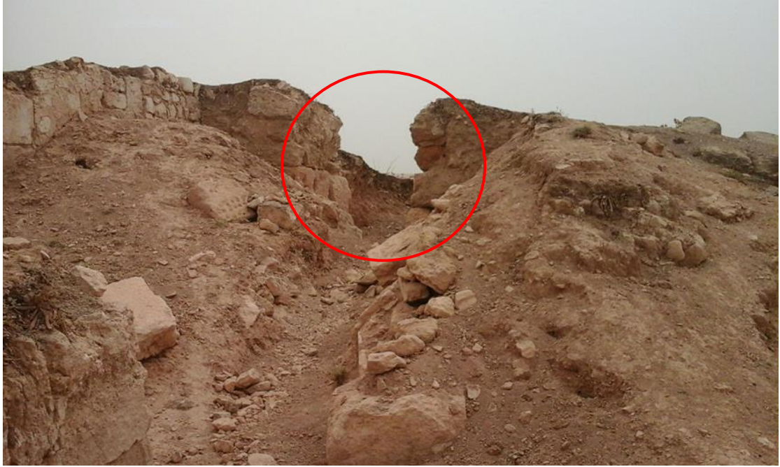
Illicit digging by looters