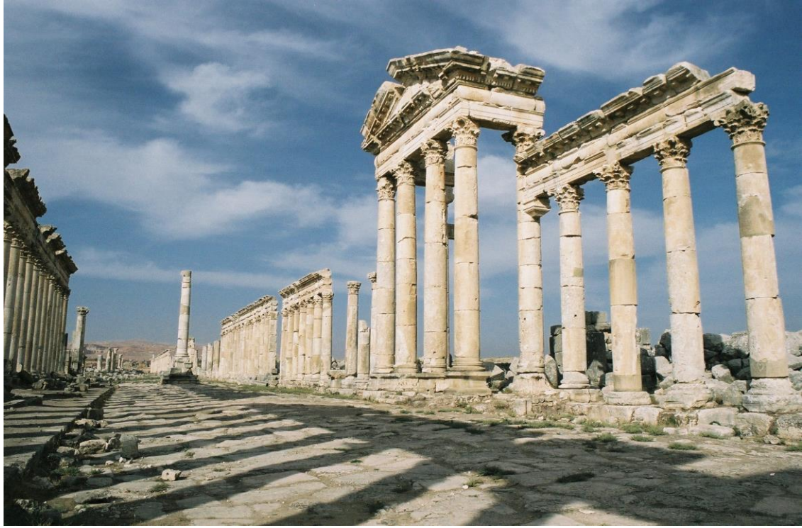
The Colonnade Street in Apamea