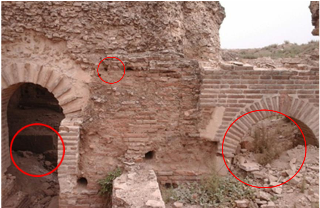
Damage caused by the regime military operations