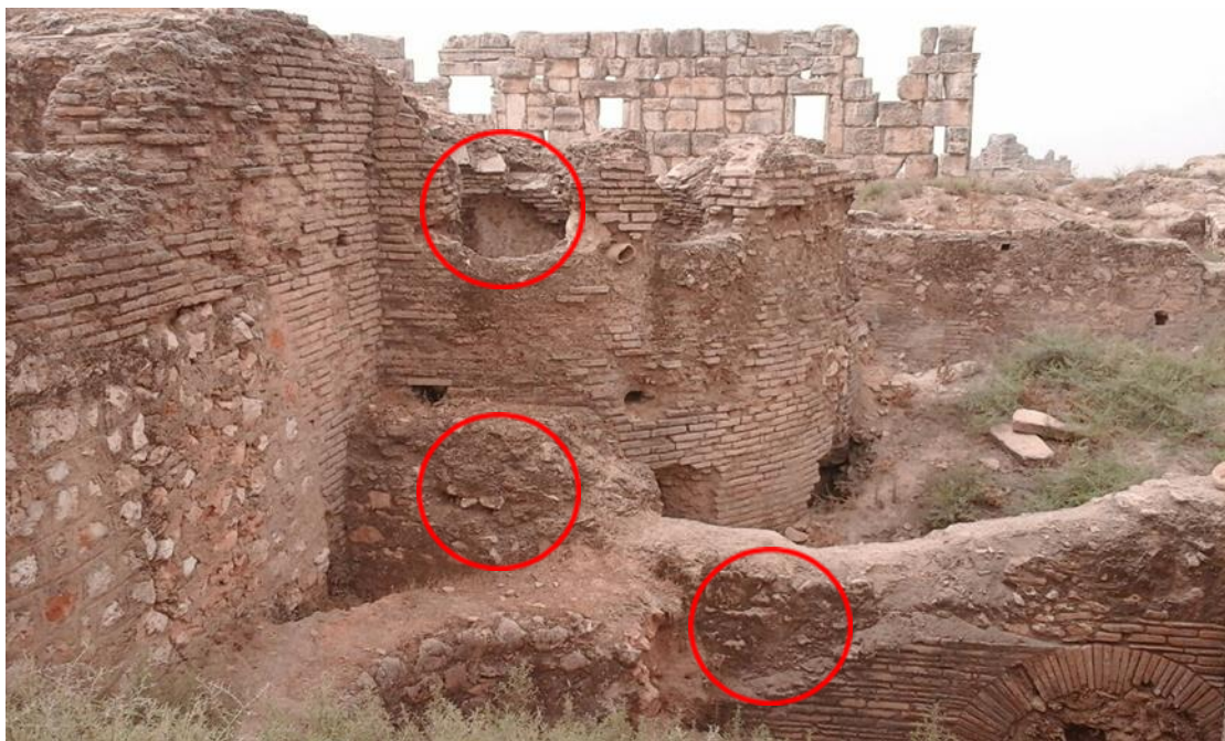
Damage caused by erosion due to weathering and neglect.