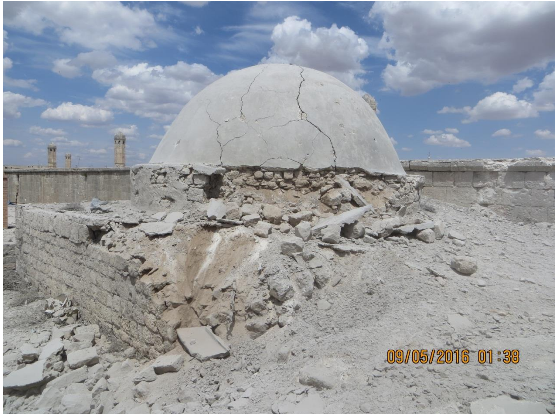
Damage to the main dome on the Bathhouse ( Hammam ) roof