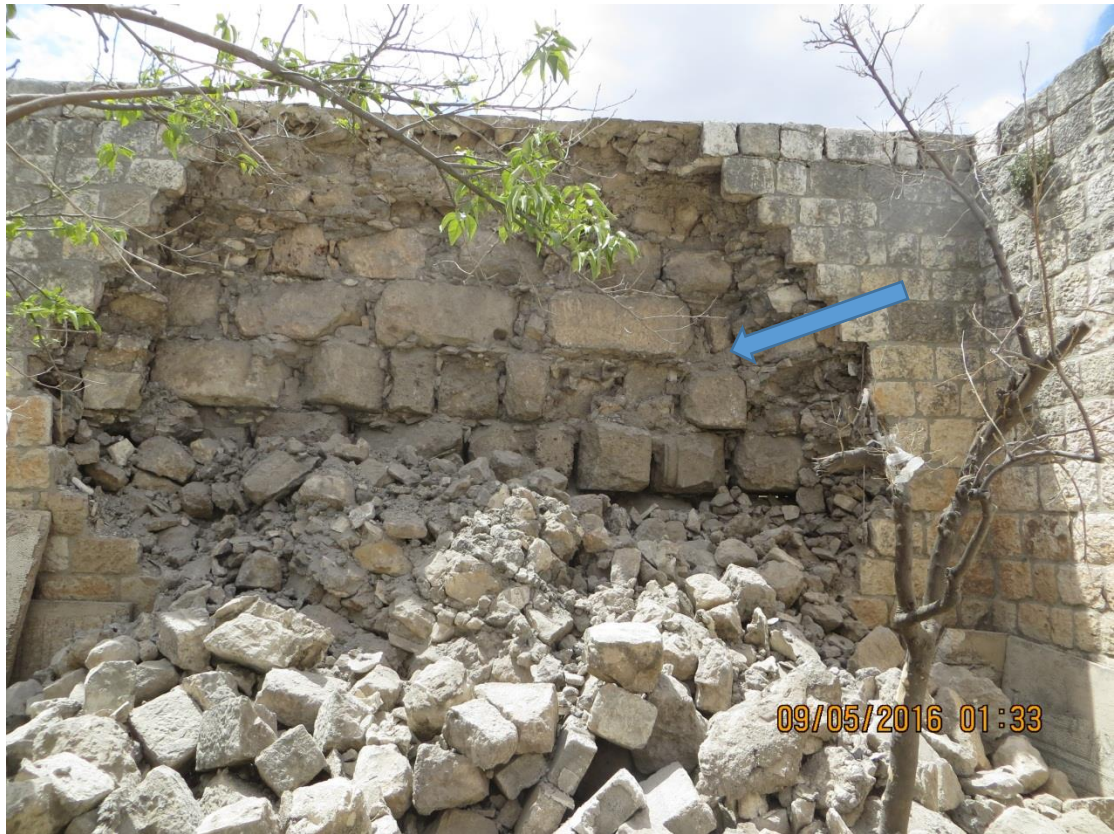
Damage to external wall (see plan above)