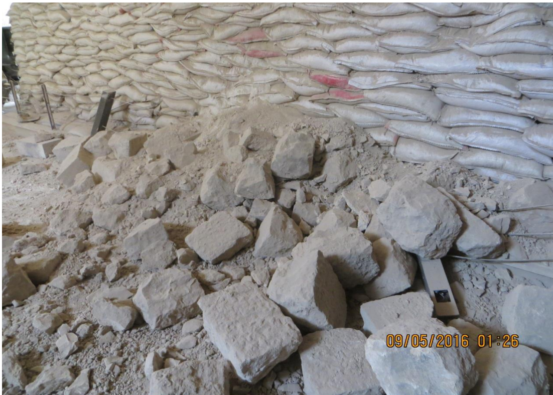
Rubble collapse over the mosaic of Hercules. The mosaic appears to be undamaged due to the protection provided by the sandbags.