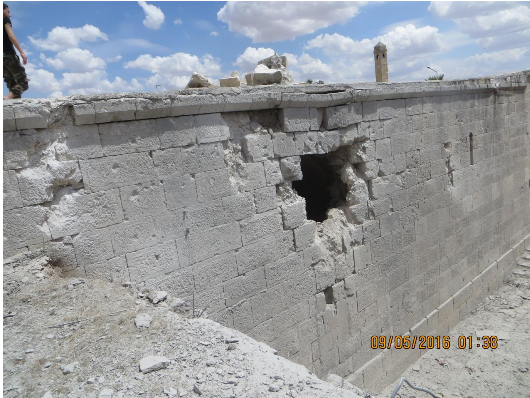
Damage causing a breach in the wall (outside)