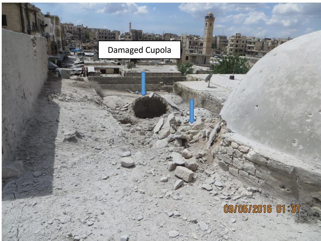
Roof of the Bathhouse (Hammam)