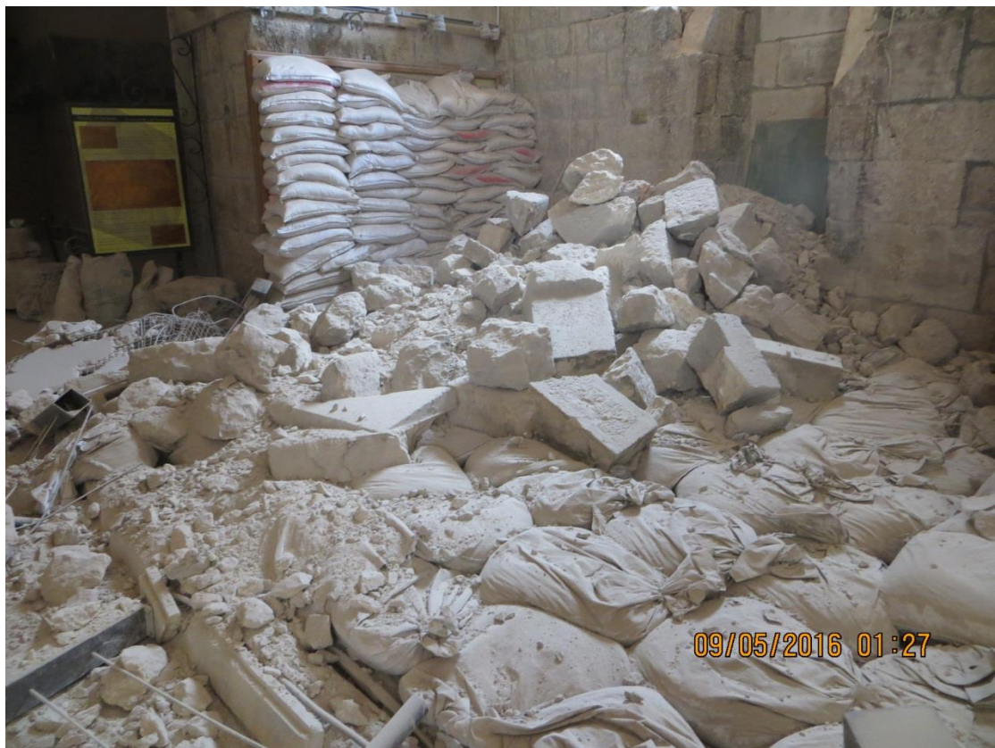
Rubble collapse over mosaic