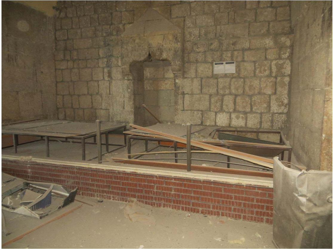
Other damage to the museum square