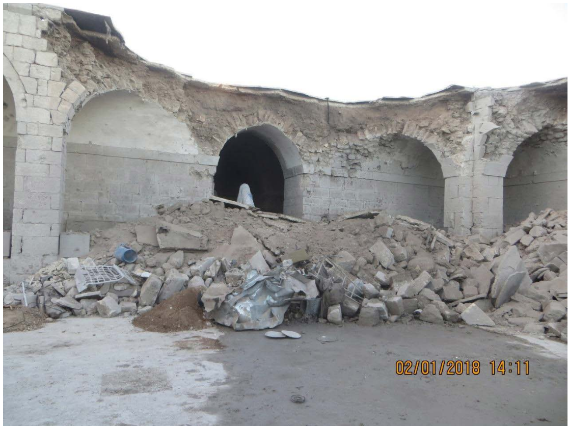
1- Damage of the ceiling from the top