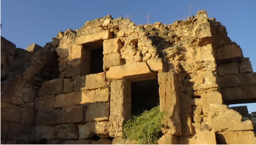
The southern side shows some damage caused by weather and neglect