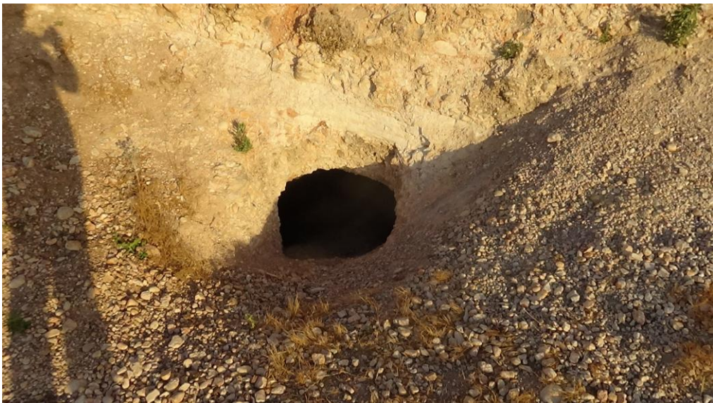
The northern side of the building – illegal excavations