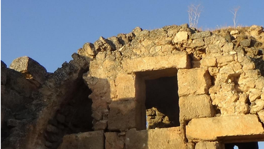
Damage caused by weather factors from the west of the building