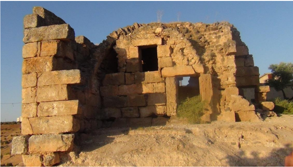
The façade from the west shows some illegal excavations