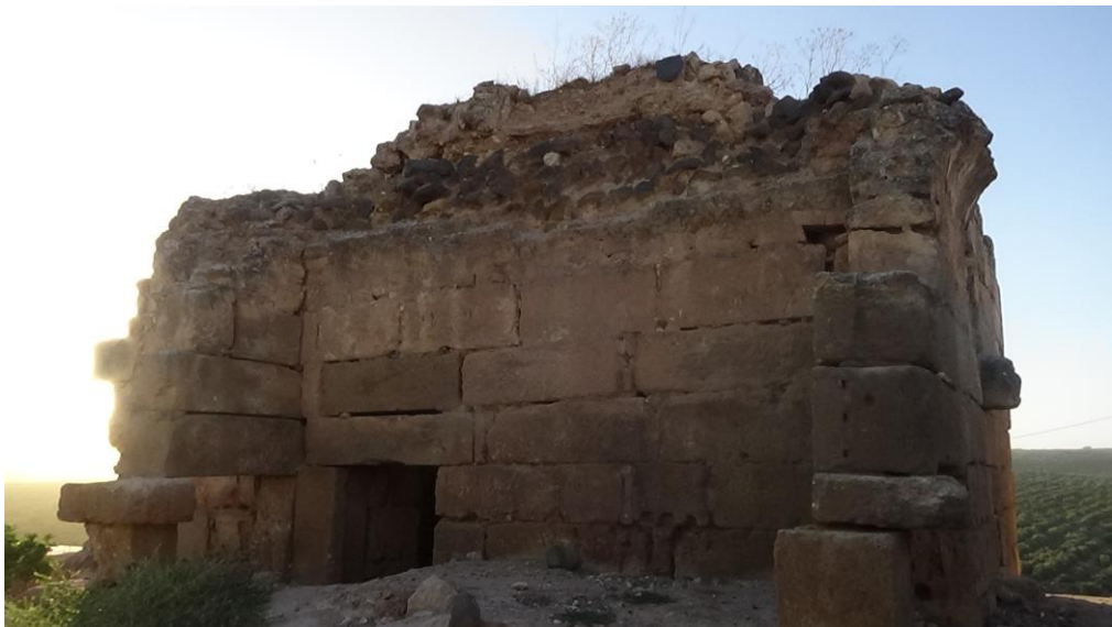
The southern side of the building