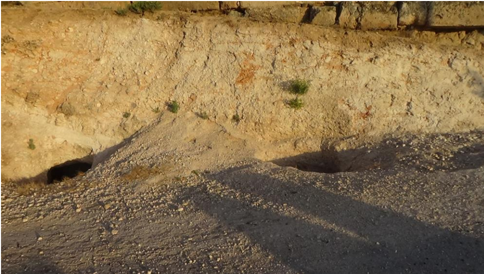
An illegal excavation from the north