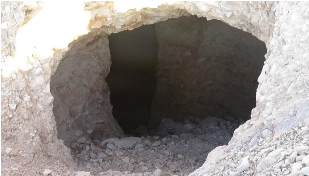
Inside the hole from the north side