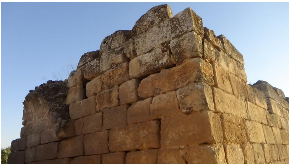
North-east corner of building