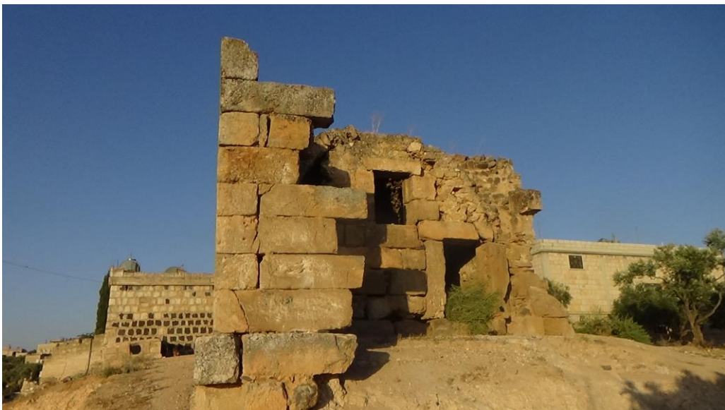
Some damage caused by neglecting