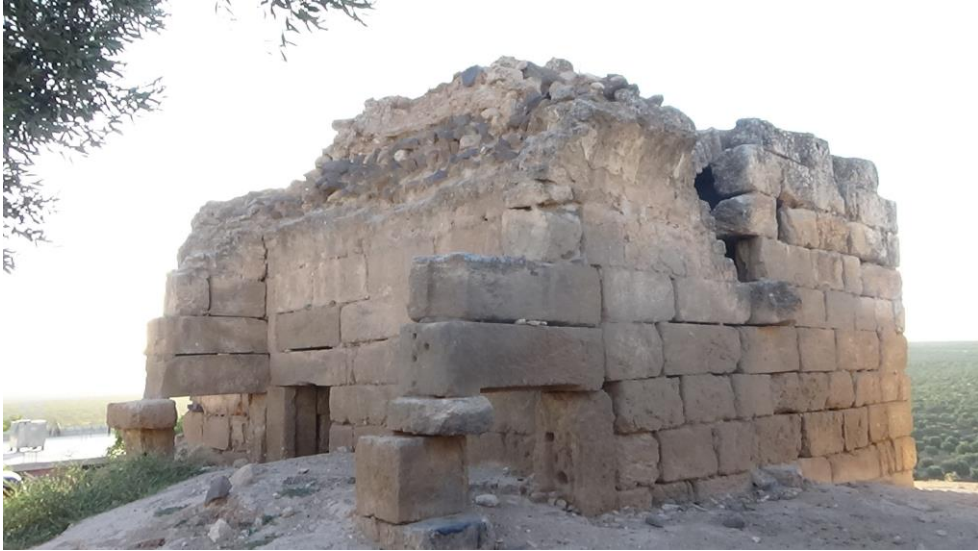
The eastern side with some illegal excavations