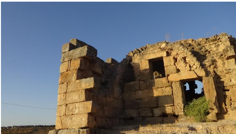
Some damage caused by neglecting