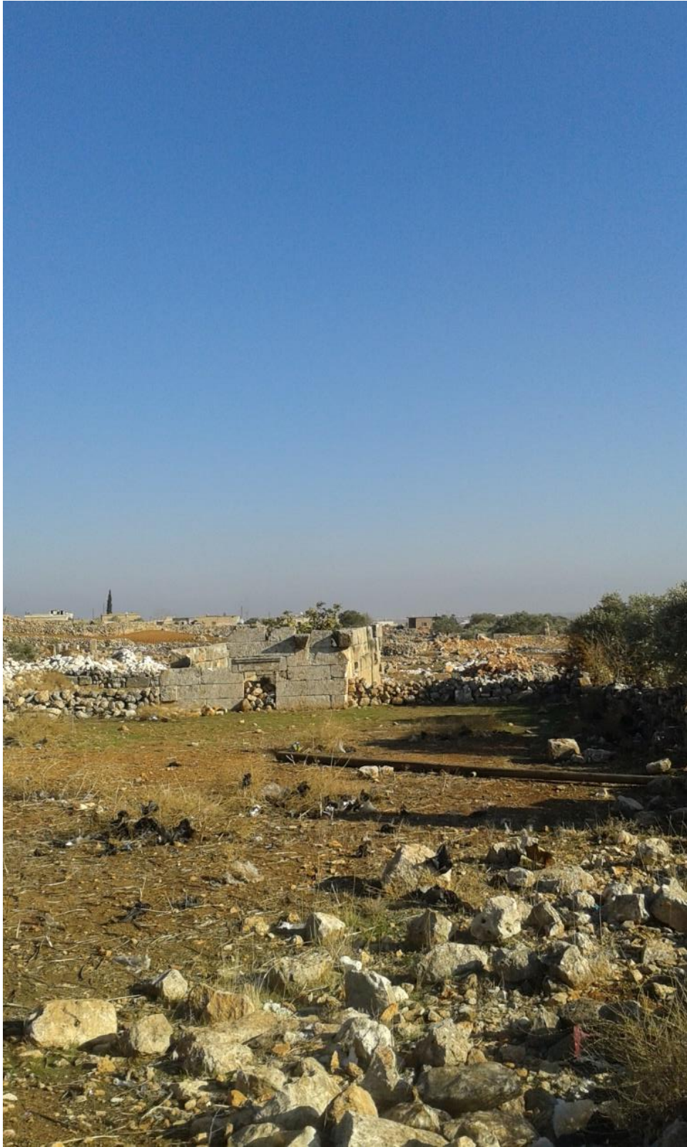
Stones removed from site buildings and monuments