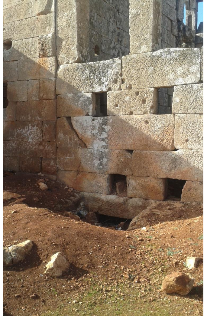
sites, villas, and other

Illicit digging near a wall in Al-Banat villa