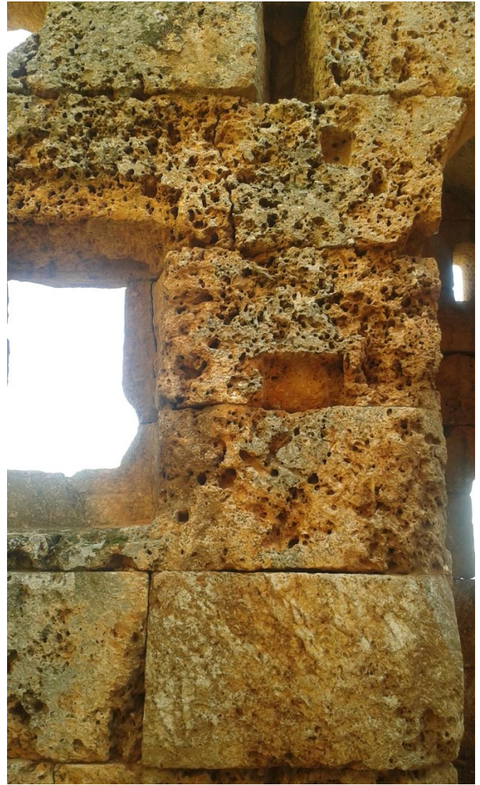
Weathering effects on stone

- Reuse of stone masonry from villas and historical structures for new construction.