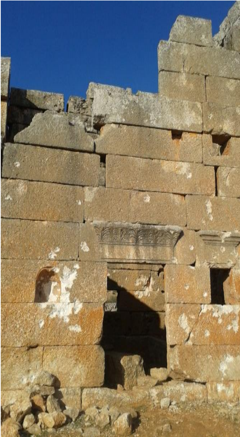
Photo showing bullet marks on the wall of a residential villa