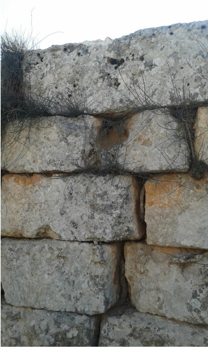
Vegetation effects on stone