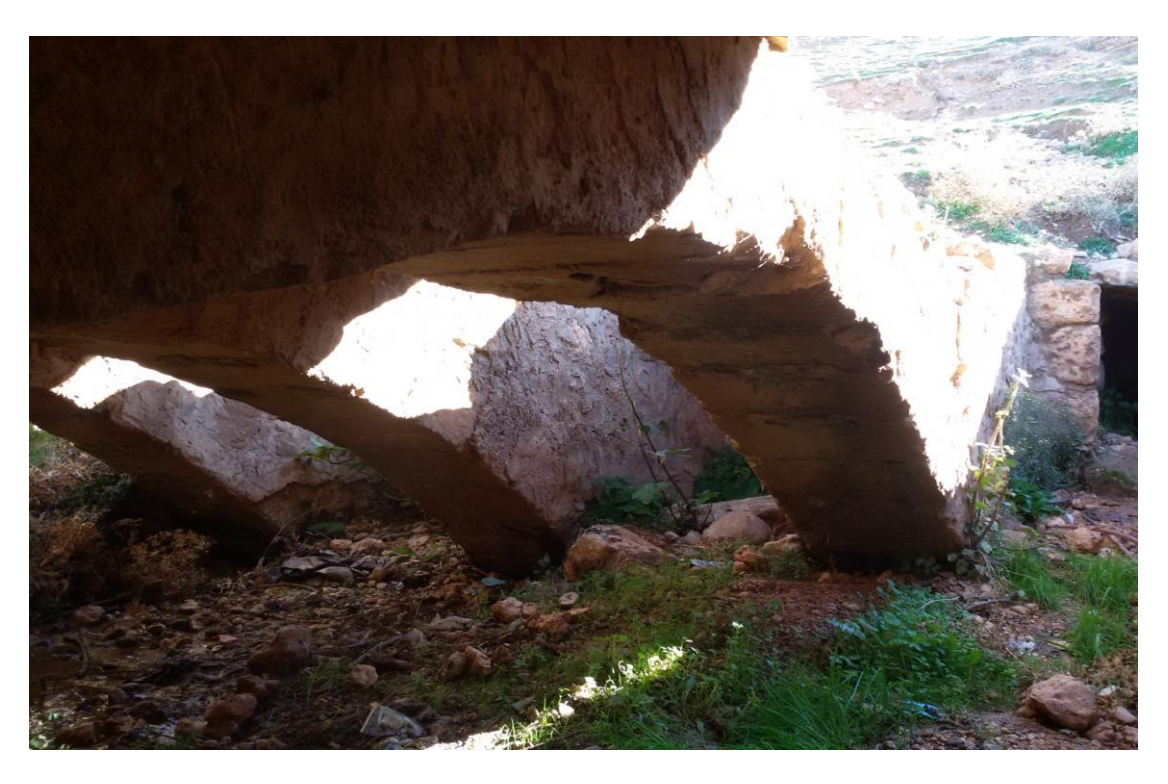
The spring runs year-round becoming most swollen in springtime.