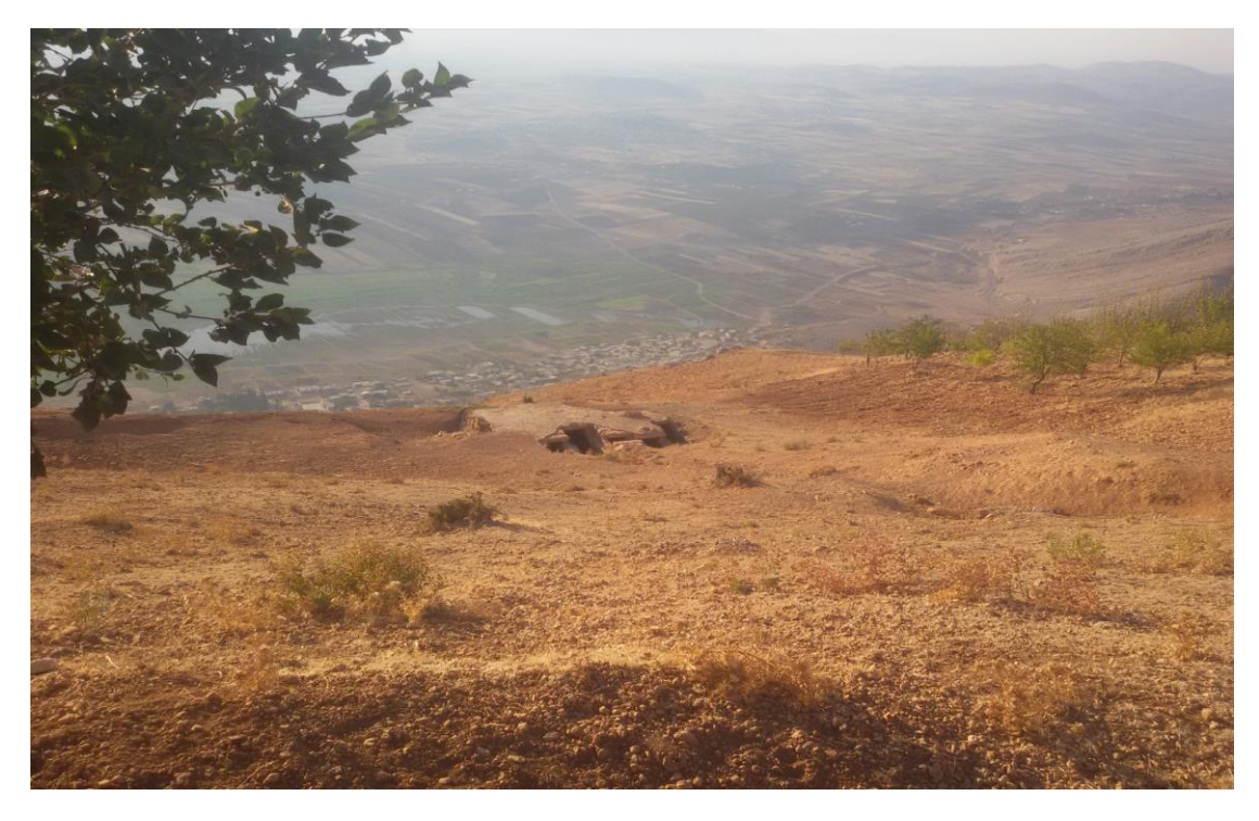
There is illicit digging around the spring and its ruins