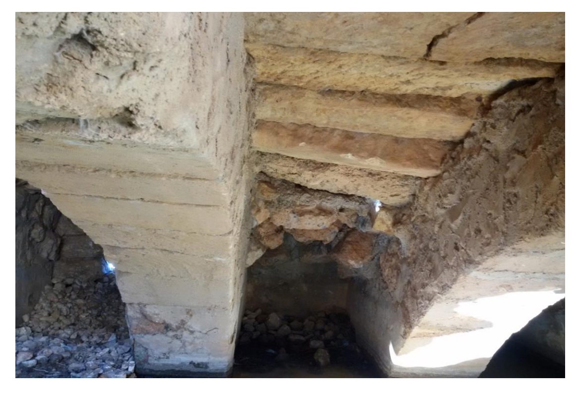
Damage due to weathering and neglect