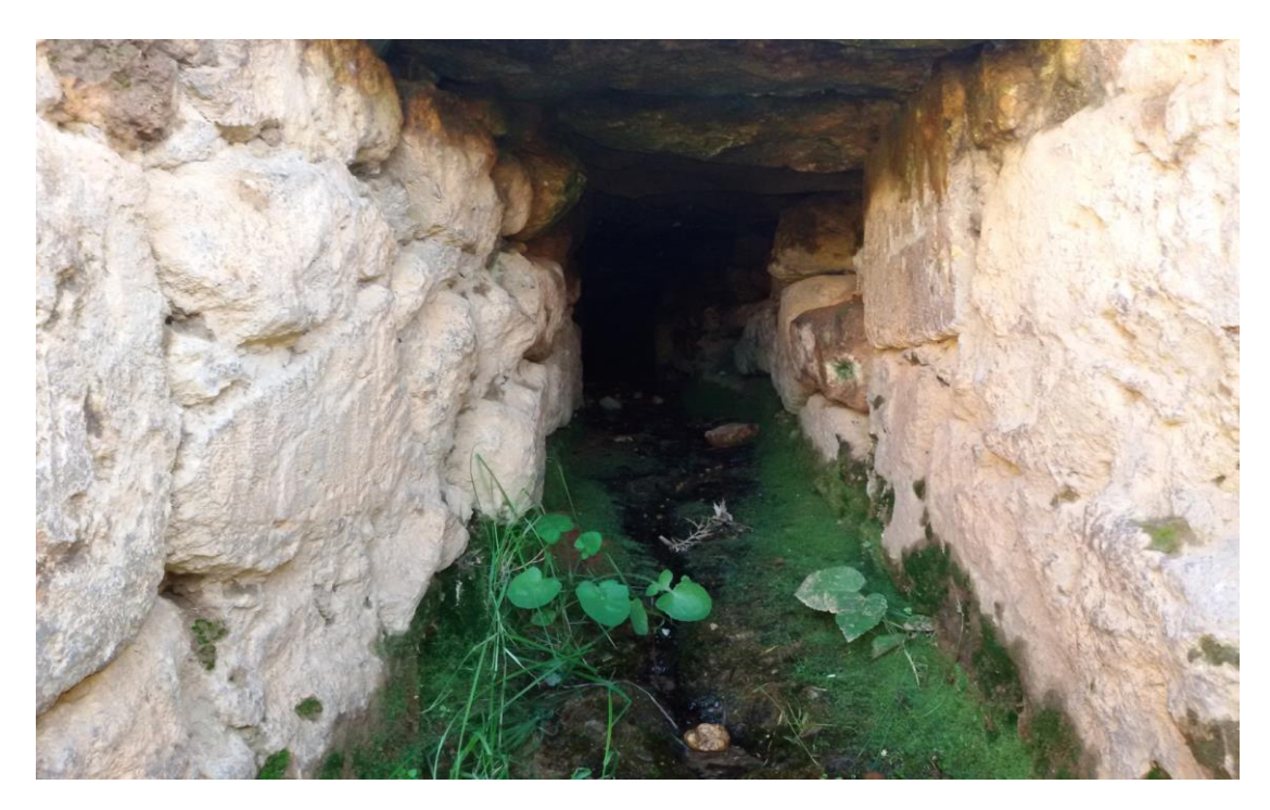
Grass and waste obstructing the main channel