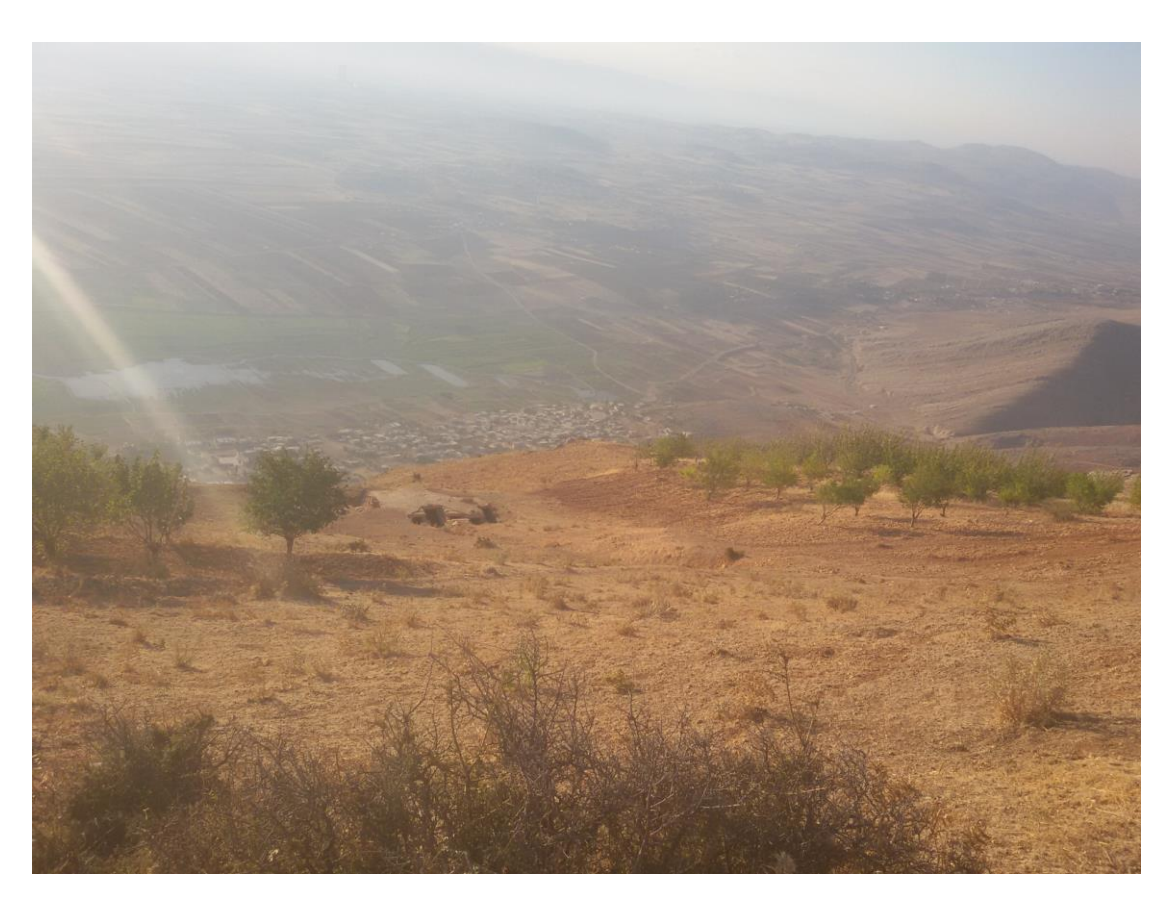
Overlooking Al-Ghab plain facing west