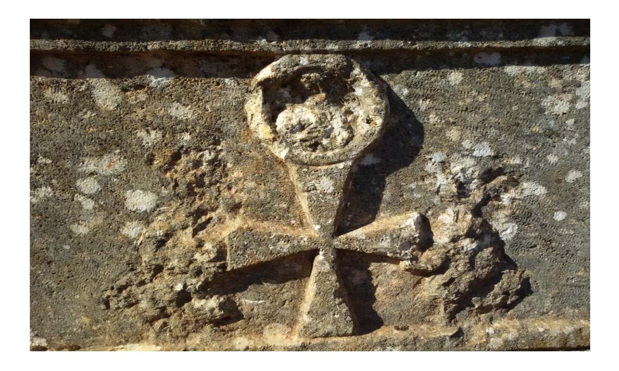
The south and west sides bear faded plants and geometrical shapes