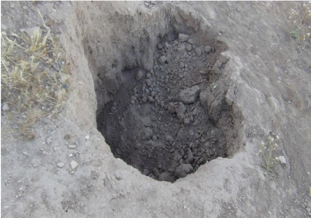
Digging activity 19 Length: 4.5m - Width: 2.5m - Depth: 1m