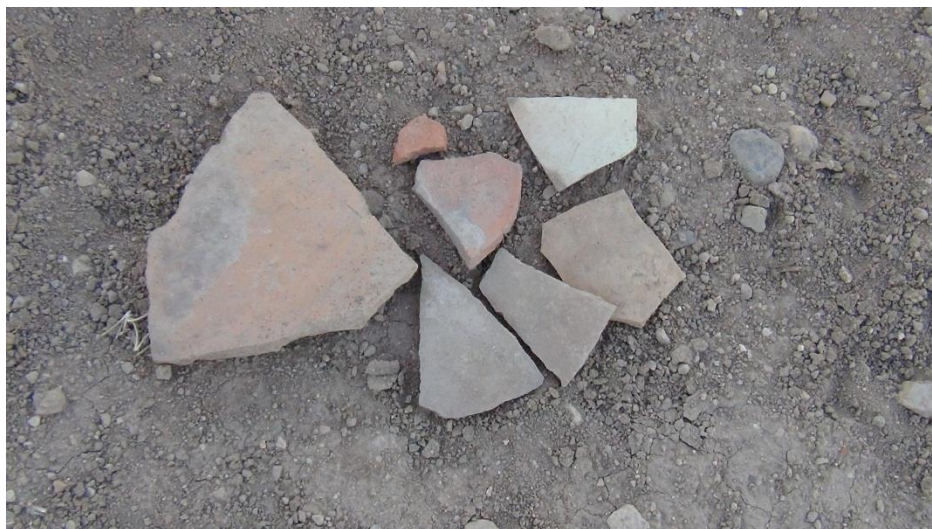
Objects and pottery sherds recovered from the surface of the Tell/mound

The mound has suffered a lot of damage in recent years due to illicit digging, clearing activity, and excavation with heavy machinery, trucks, and metal detectors, as well as systematic bombardment of the site and nearby village. Clearing with heavy machinery was done for the purpose of reclaiming land in the mound exclusion areas to plant fruit-bearing trees. During the site monitoring visit numerous pits and holes of varying dimensions were documented.