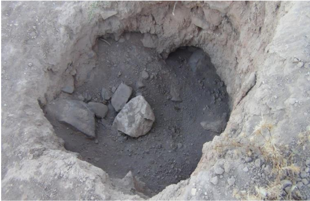
The charcoal layer is seen clearly in this photo.