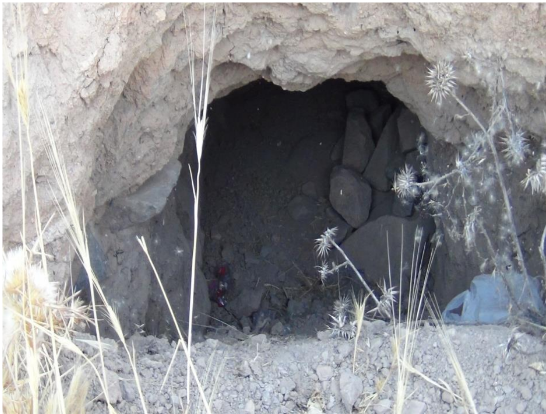
Digging activity 21: (looting pit) Length: 5.10m - Width: 1m - Depth: 1.15m