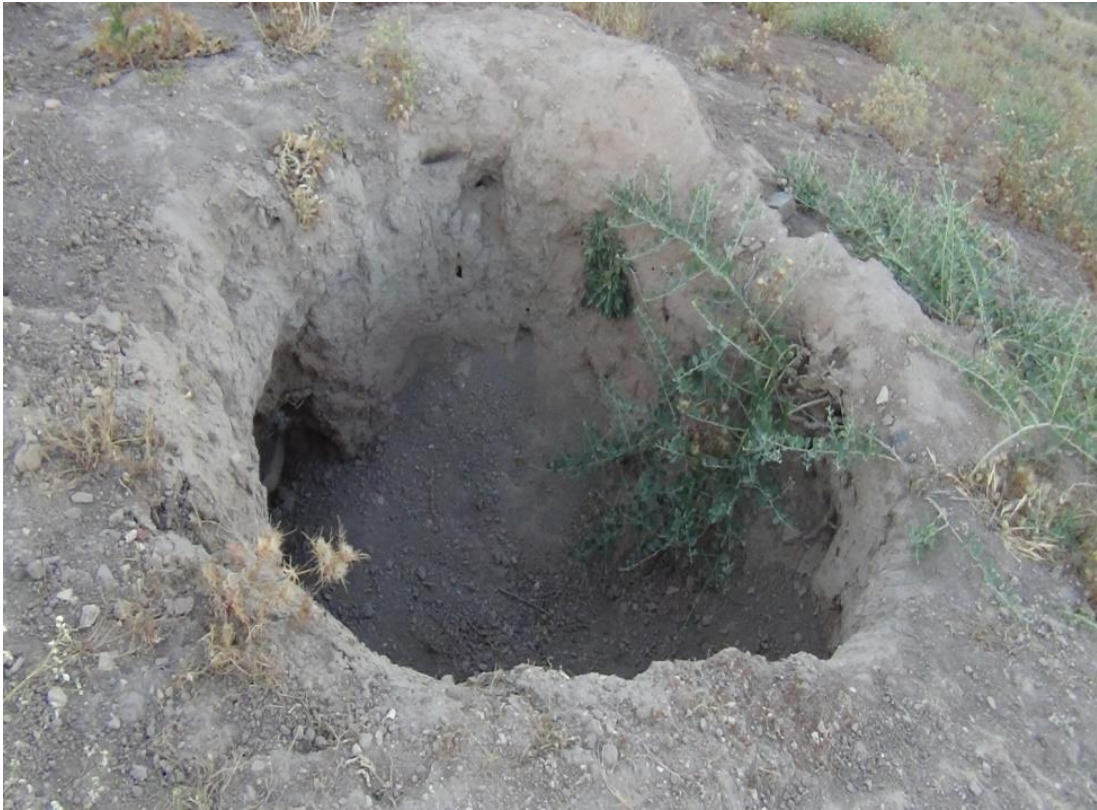
Digging activity 23: (Looting pit) Diameter 2.5m - Depth 2.2m Note: There is a visible layer of charcoal