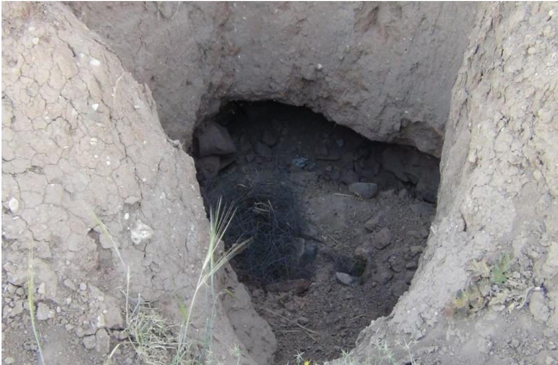
Digging activity 15 (looting pit) Length: 5.80m - Width: 3.5 - Depth: 4.2m