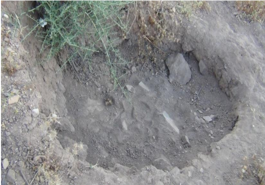
Digging activity 25 Length: 2.10m - Width 1.20m - Depth 1.30m