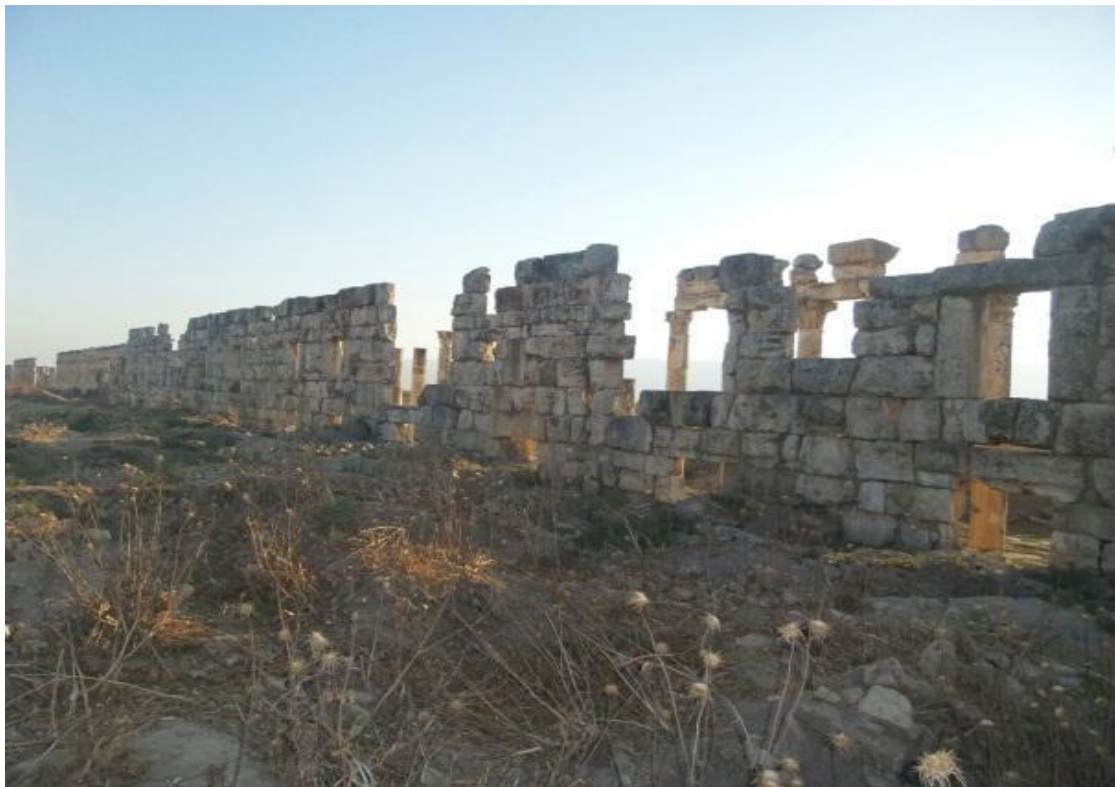
Decorative walls on the main street of the ancient city of Apamea