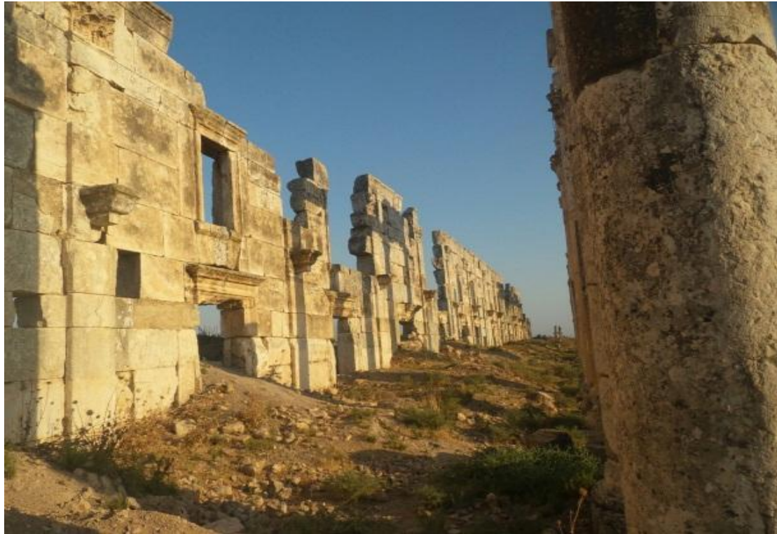
Part of the decorative walls in the main street of the ancient city of Apamea