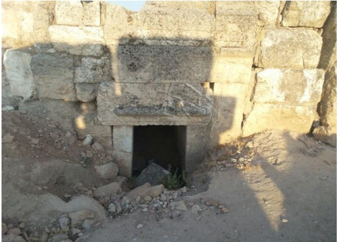
A site that has been violated in the ancient city of Apamea