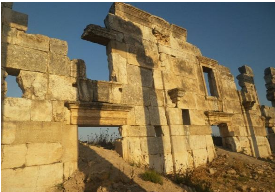
Part of the decorative walls in the main street of the ancient city of Apamea