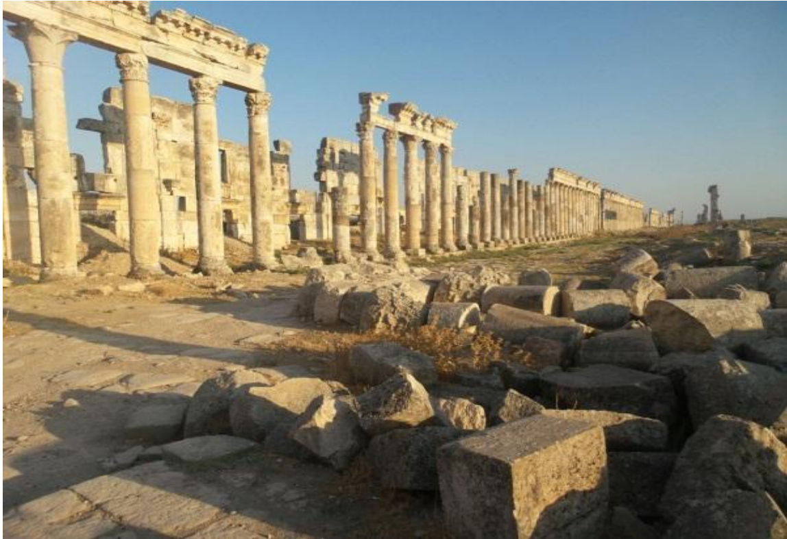
Main Colonnade Street in the ancient city of Apamea ( Cardo )