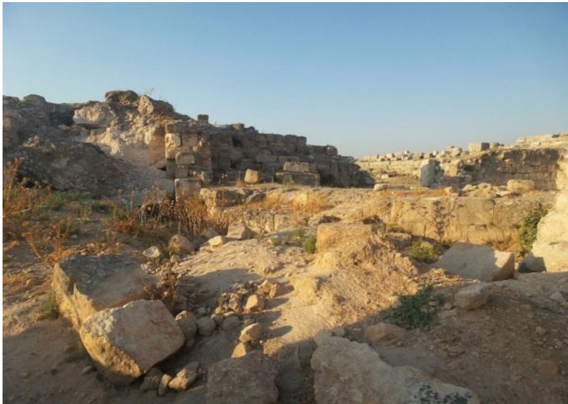
Violations in the historic city of Apamea