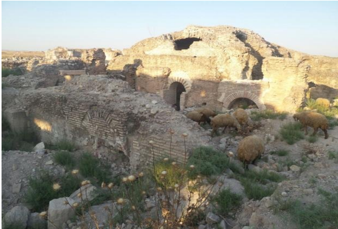
Destruction in the ancient city of Apamea