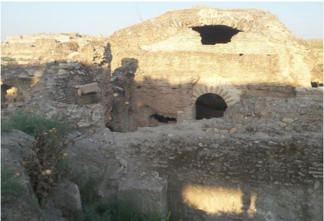
Destruction in the ancient city of Apamea