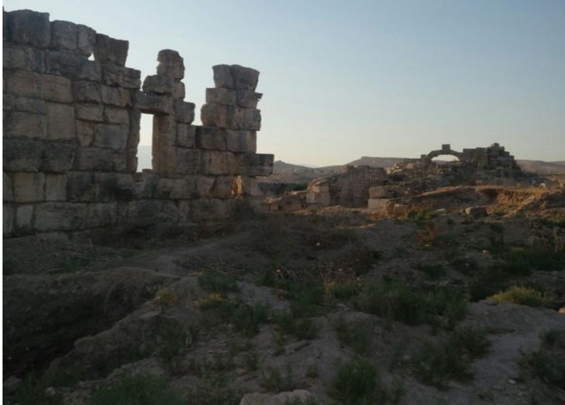
Area behind the decorative walls on the main street of Apamea