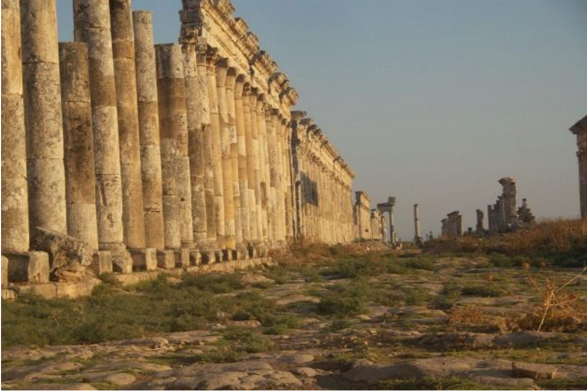
Main Colonnade Street in the ancient city of Apamea ( Cardo )