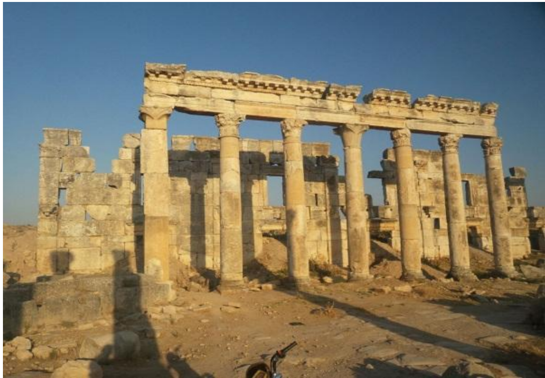
Main Colonnade Street in the ancient city of Apamea ( Cardo )