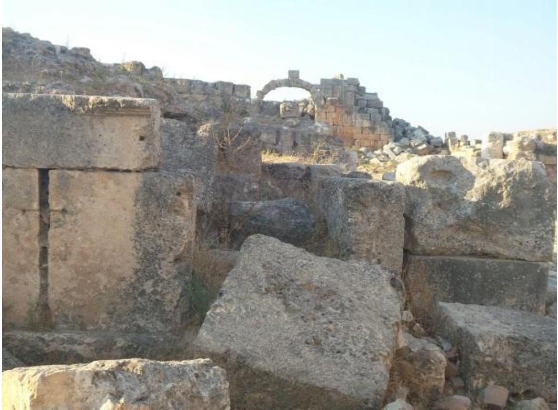
Picture of the destruction in the historic city of Apamea