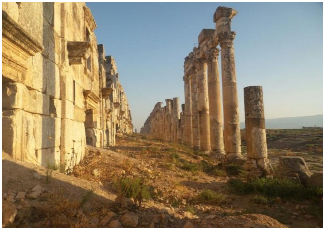
Area behind Colonnade Street in the ancient city of Apamea ( Cardo )