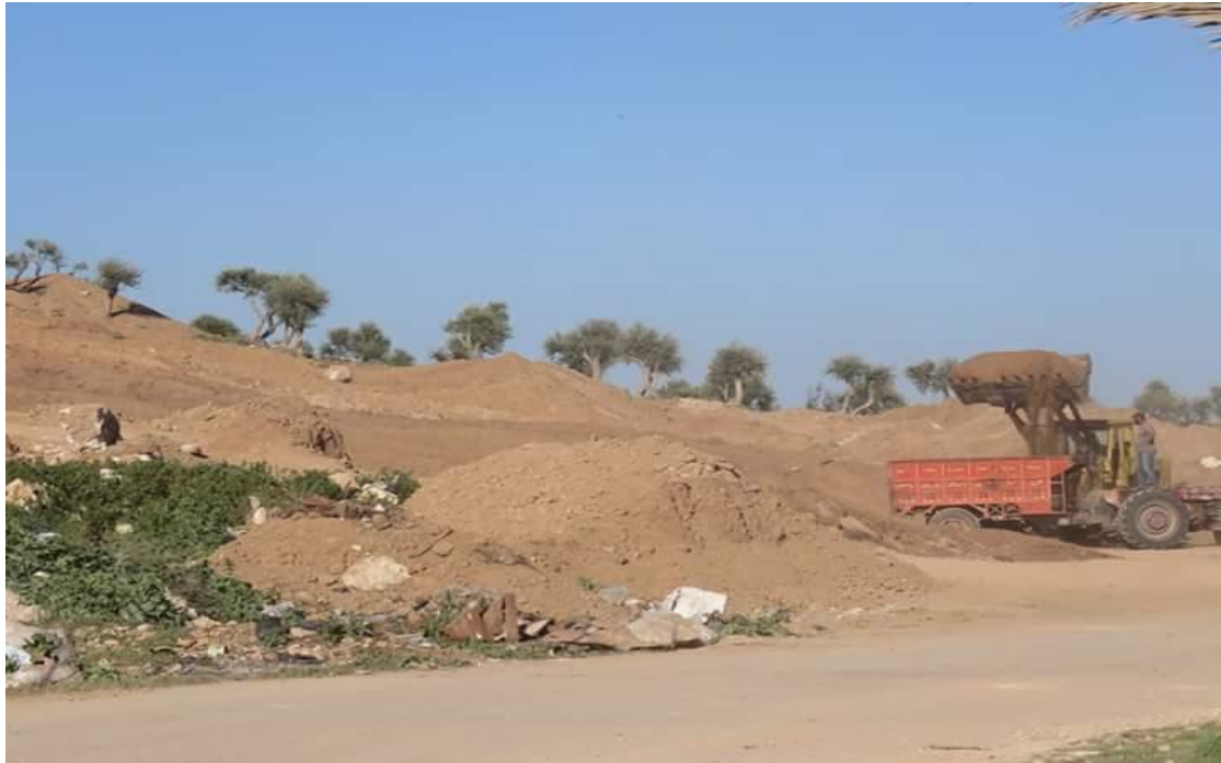
Bulldozer moving soil on the south eastern side of the tell, loading the dirt into dump trucks, and hauling it to farmlands where it is sold.