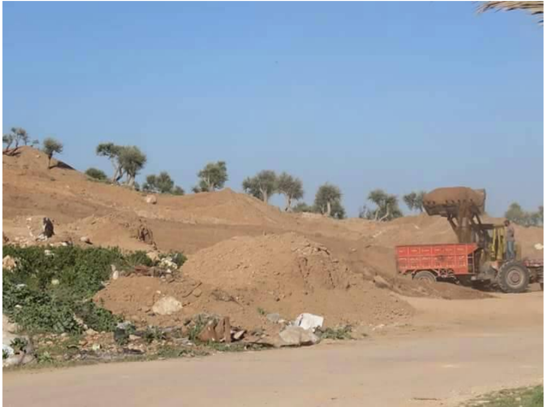
Bulldozed soil being loaded onto trucks