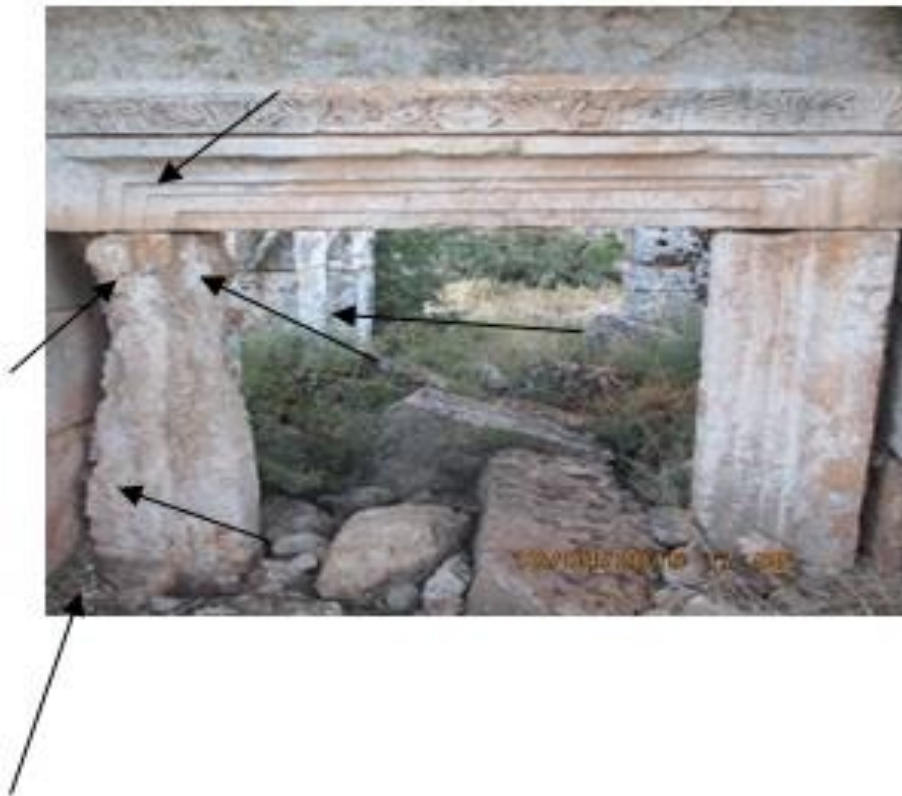
Effect of weathering and exposure (oxidation and erosion)