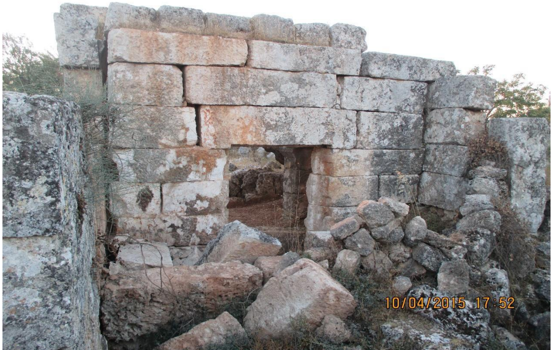
Damage to the facade of a building.