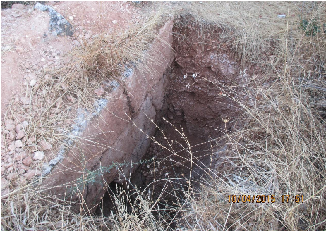
Looting pits at various locations inside the archeological site