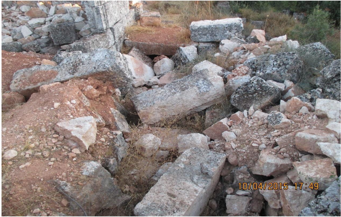
Location of the tombs inside the church