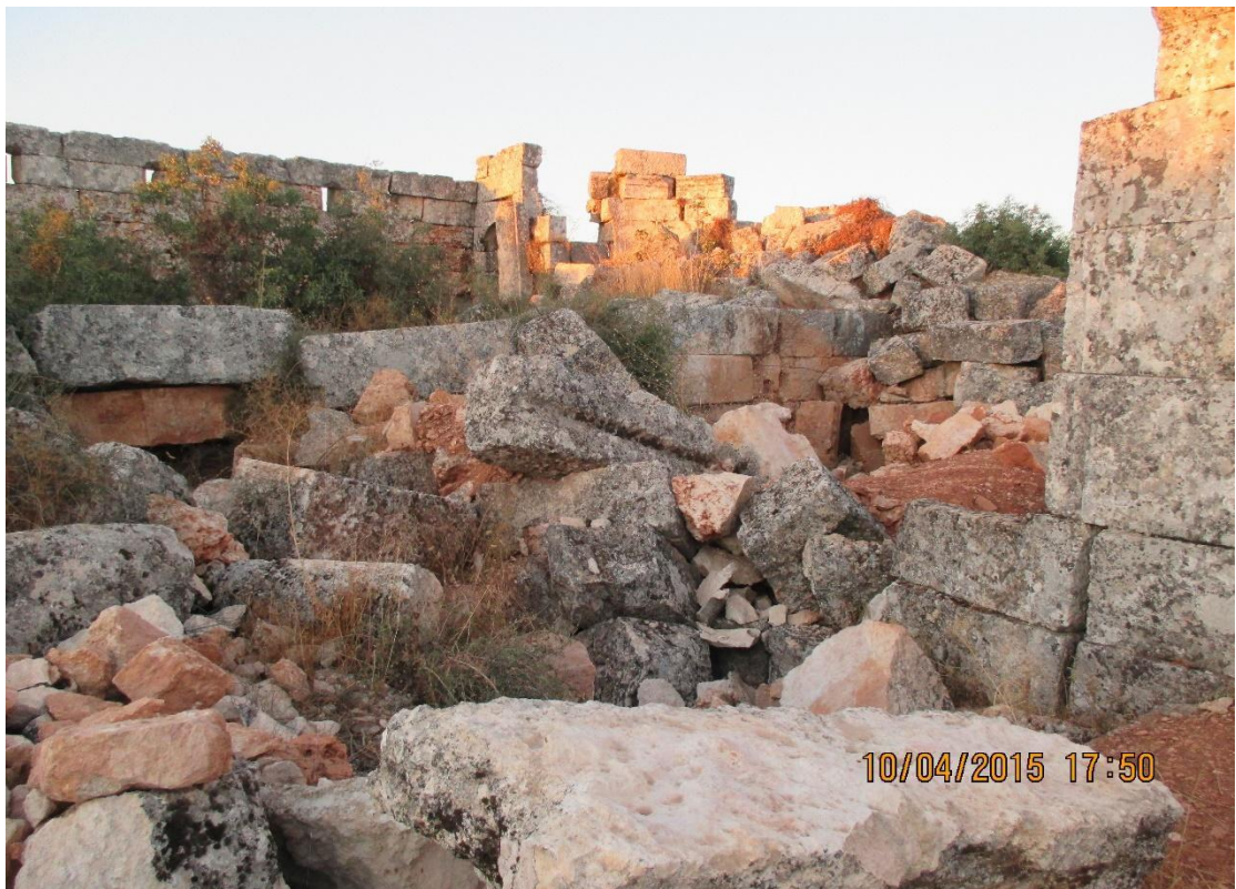
Illicit digging at a compound south of the church that has a number of collective and individual burial tombs.