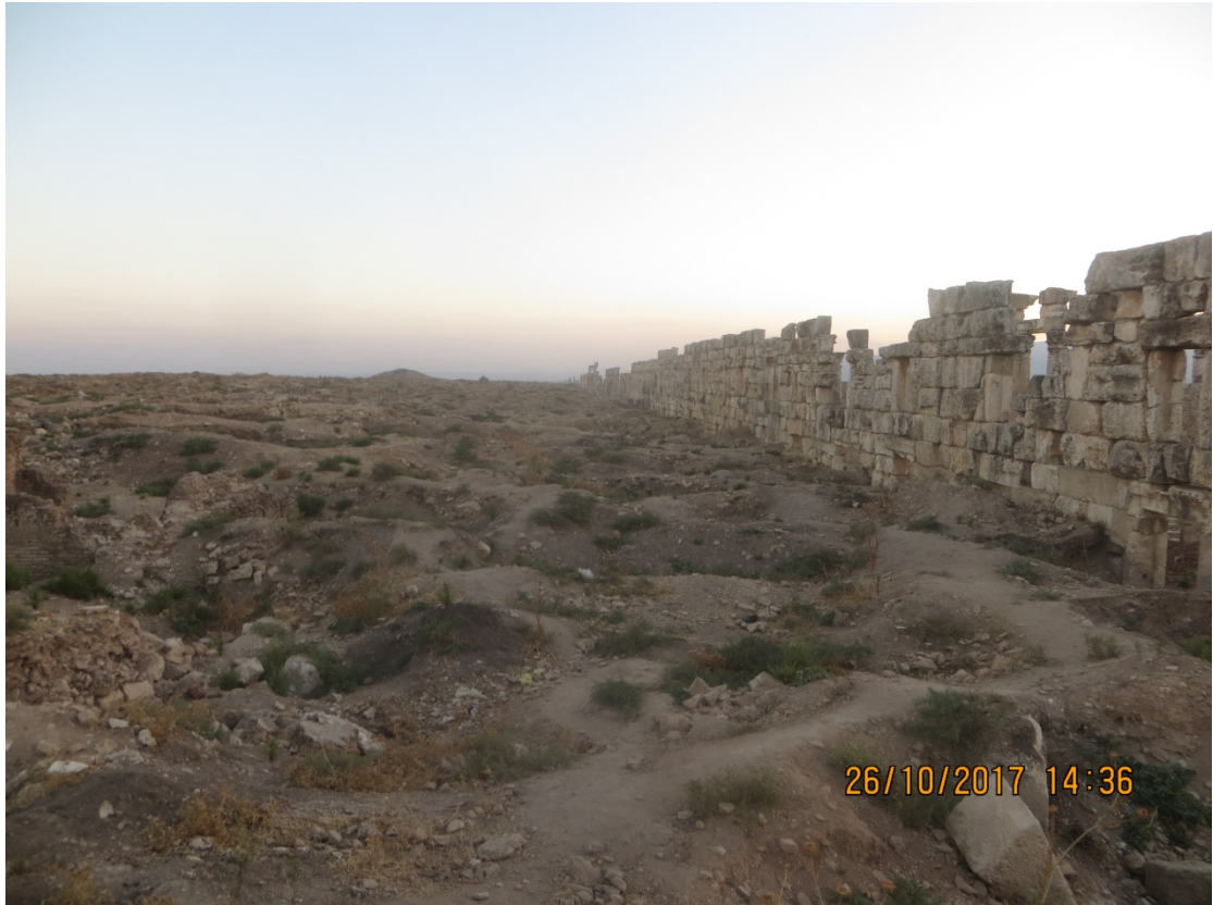
Moving the Dump from the archaeological site