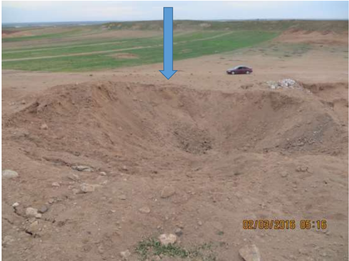
Large crater caused by Russian airstrike