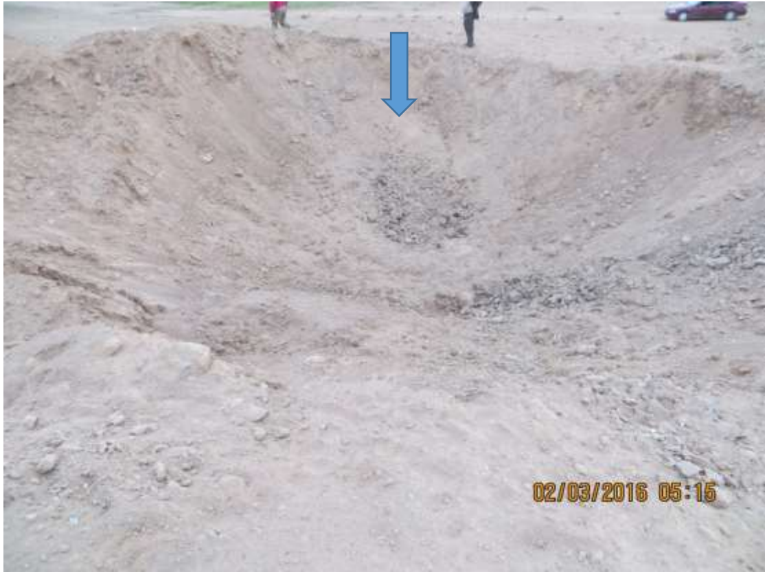
Damage caused by Russian airstrikes on the eastern side of the site