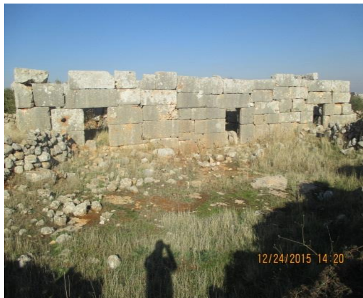
Damage caused by illegal digging and looting