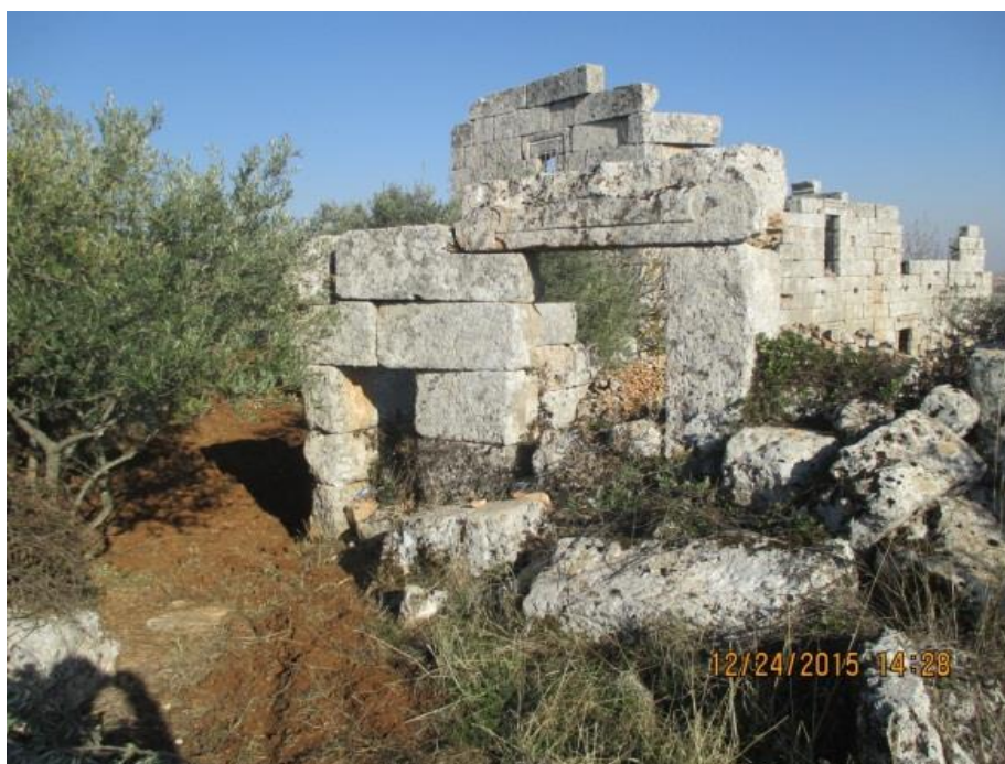
Damage Caused by Land Reclamation