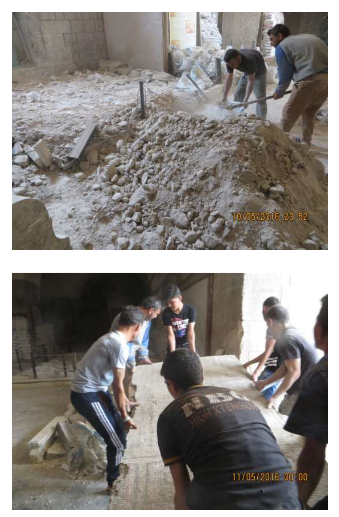
Moving mosaics from the 4^{th} wing to the 1^{st} wing for better protection