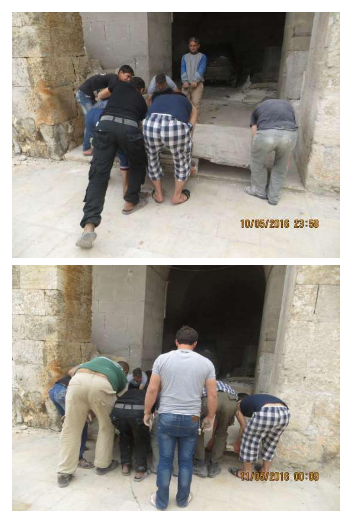
Moving mosaics into the 1<sup>st</sup> wing