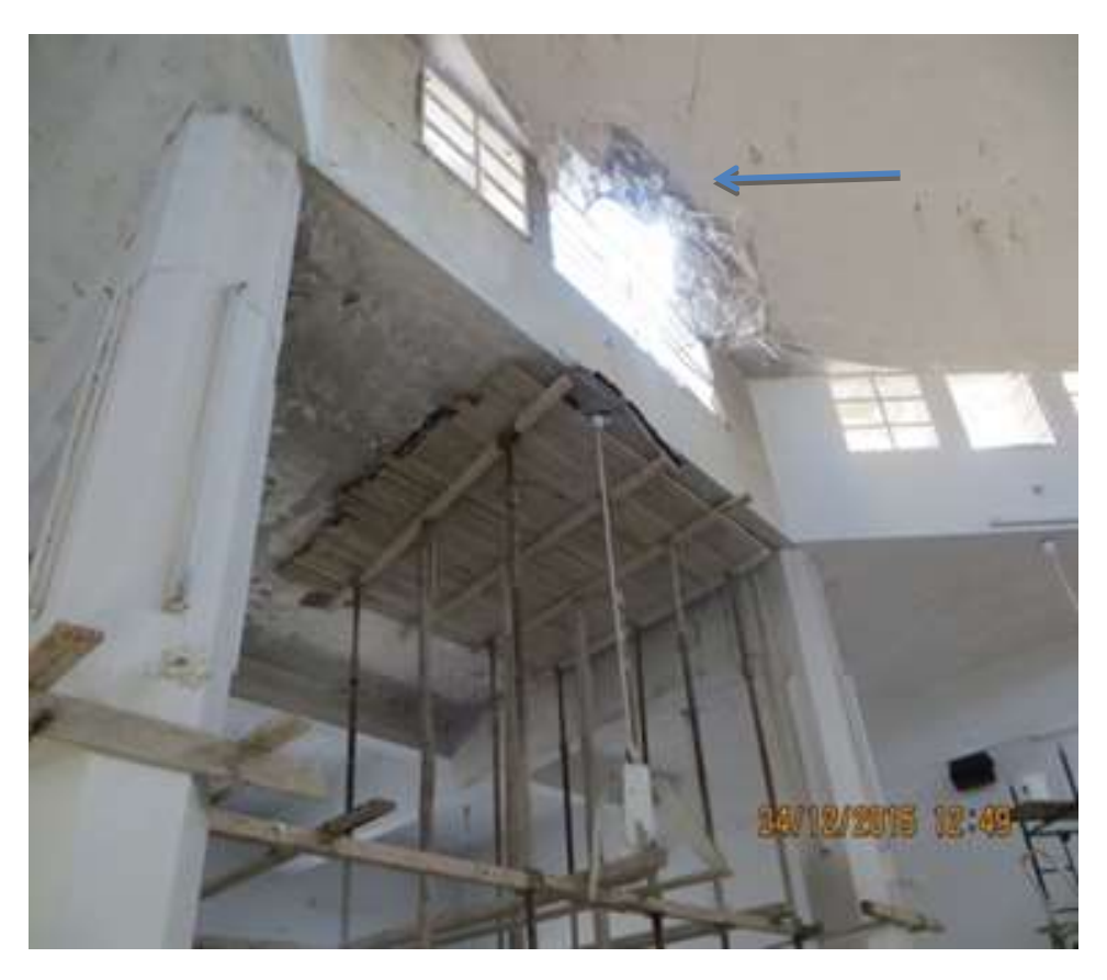
Airstrike targeted the base of the mosque's dome from the east side.