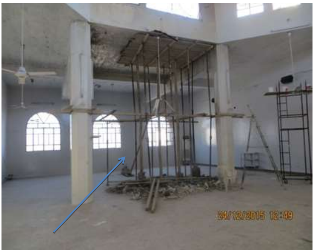
Scaffold in place to shore up damaged section of the building