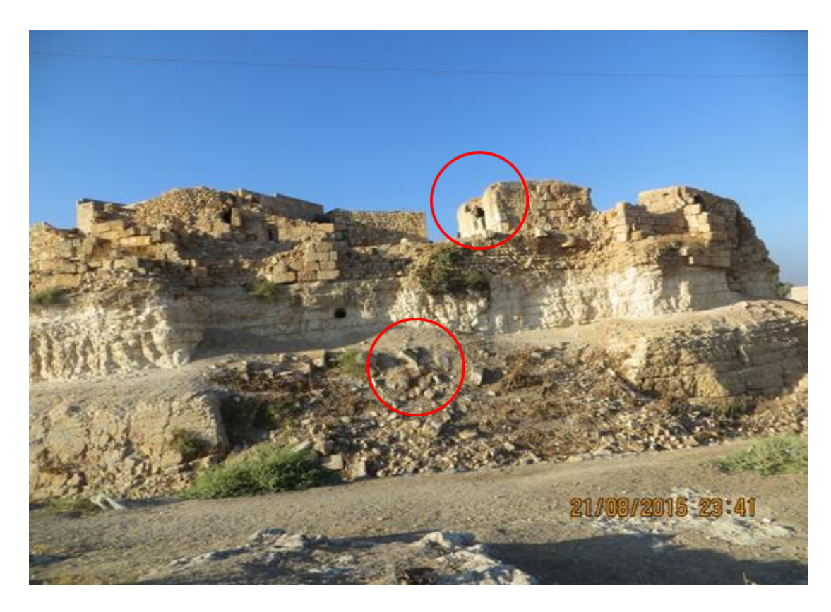
Locations that need urgent repairs to fortify calcareous layer beneath the citadel