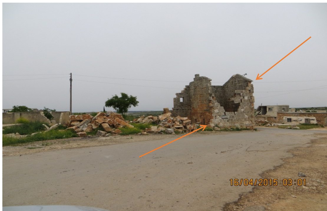
Structure before the destruction (Southeast side )