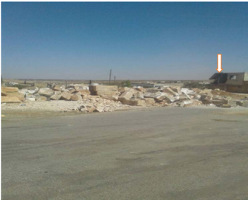
Structure completely destroyed