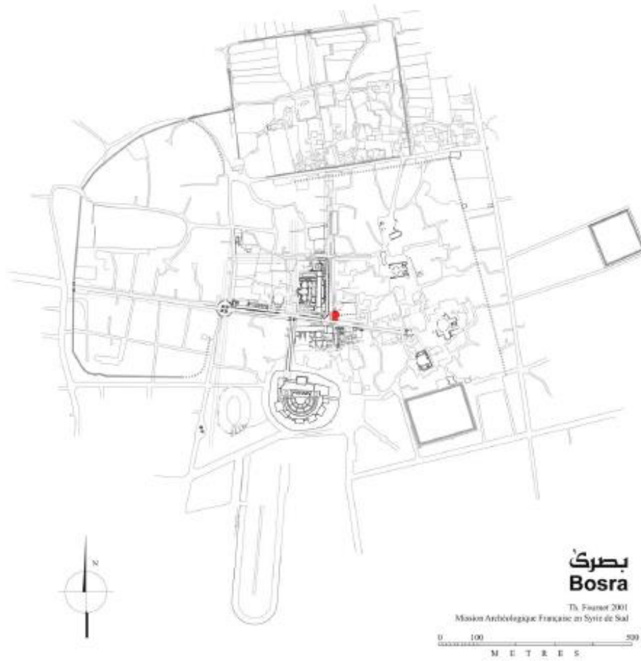
Map showing the location of the Bed in relation to the old city