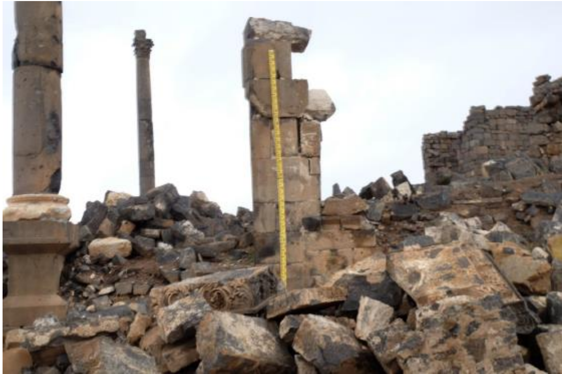
Photos illustrating the main pieces of the Kalybe after its destruction