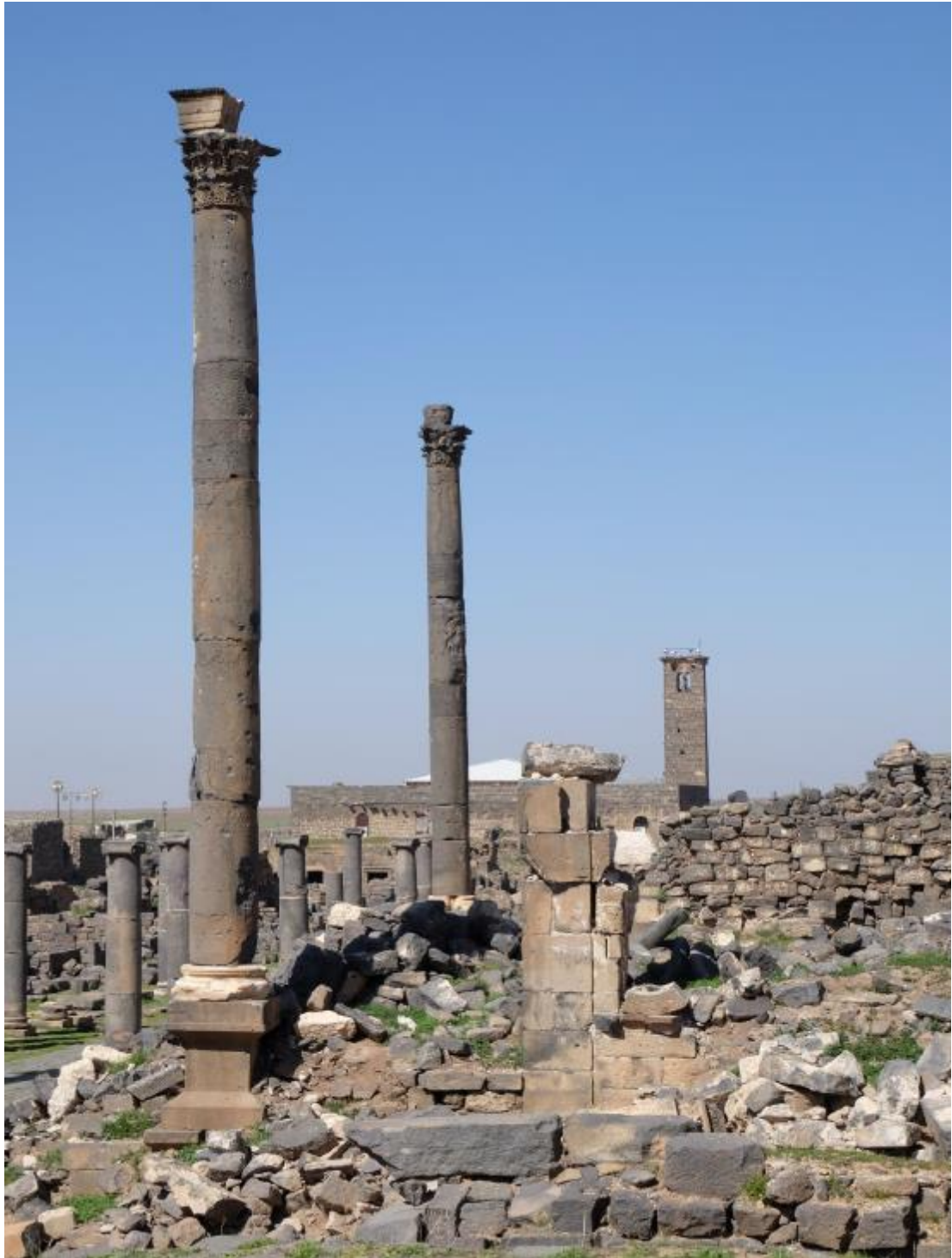
Photos illustrating the destruction to the Kalybe by tank shells