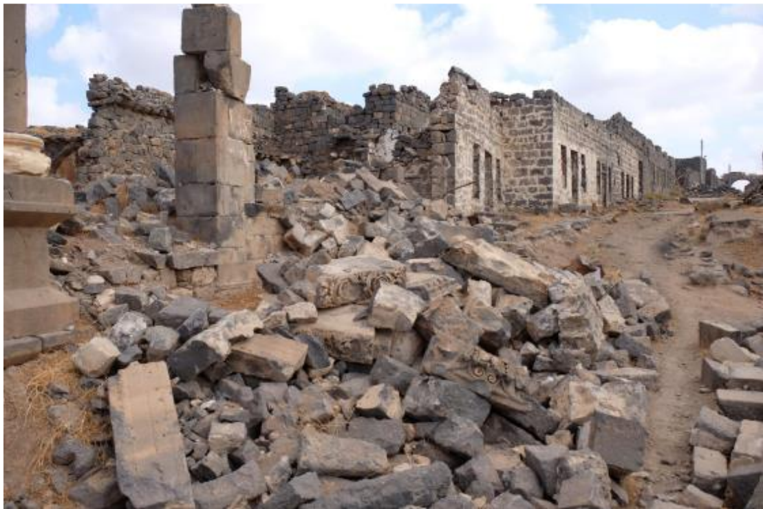
A pile of rubble and stone masonry blocking the road to the Nabatean Door