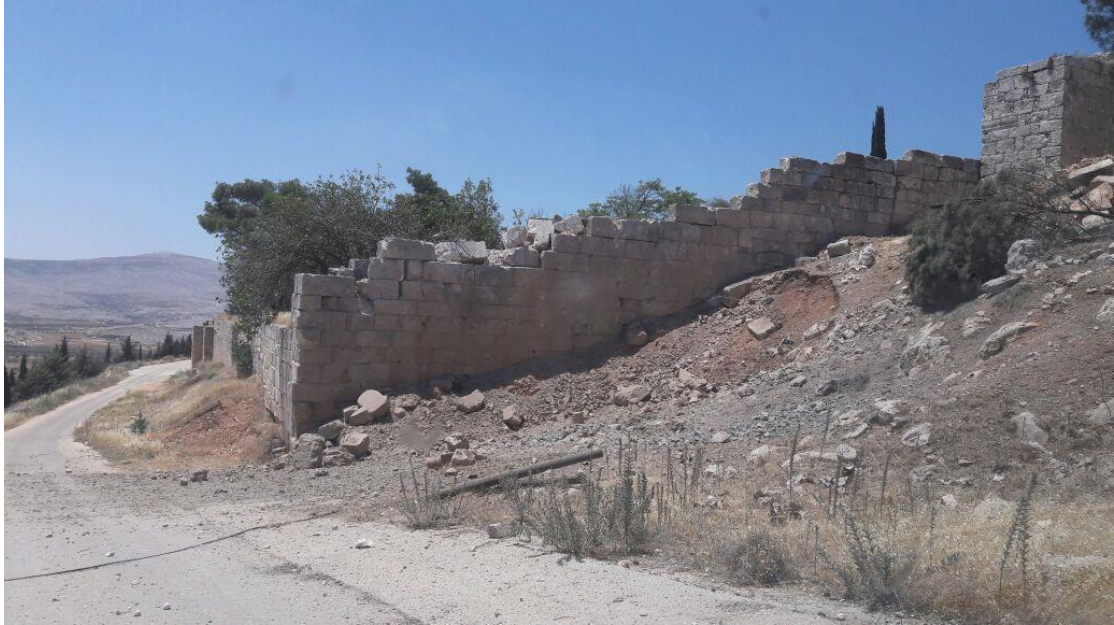
Northeast corner (Photo facing south)