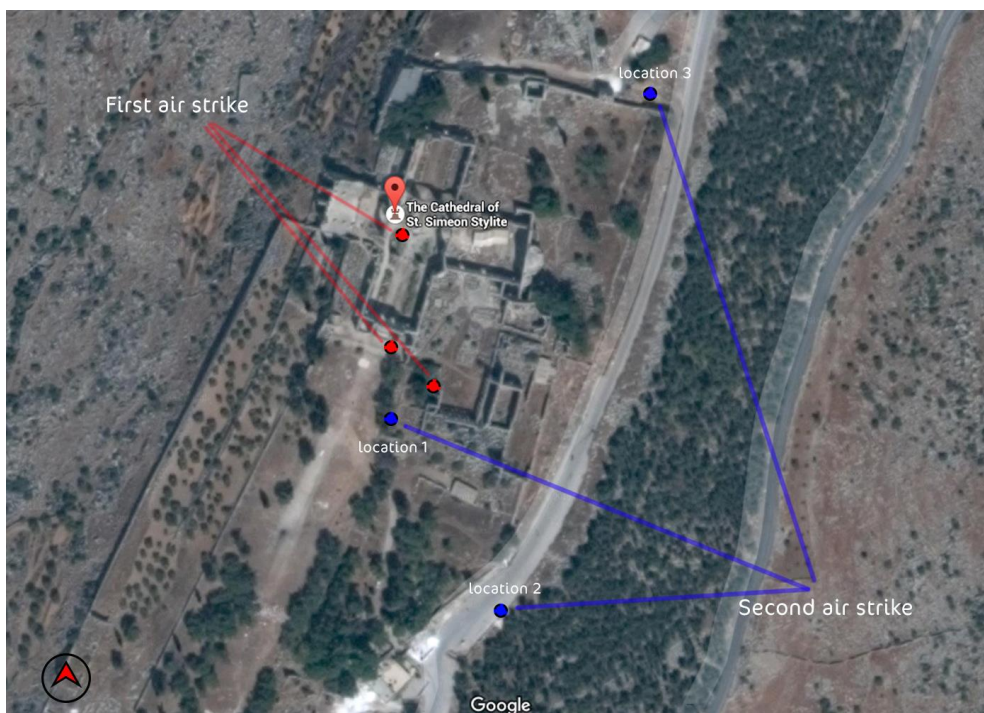
Map showing first airstrike in May (Red) and second airstrike in June (Blue)