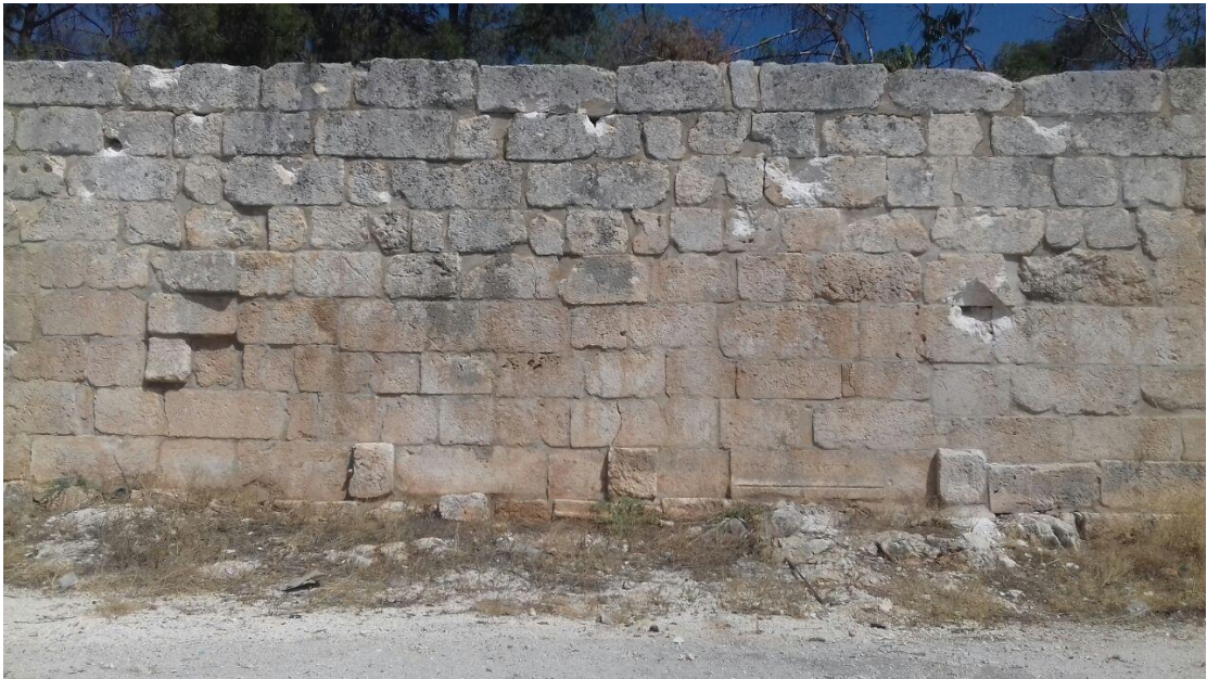
Damage to external wall (photo facing west)