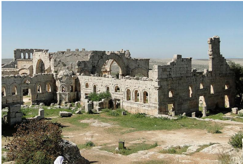
General view of the site prior to the airstrikes

The first airstrike on the site of St, Simeon occurred on Thursday May 12th, 2016 and caused extensive damage to the site. The TDA-HPI team documented that strike in a separate report.