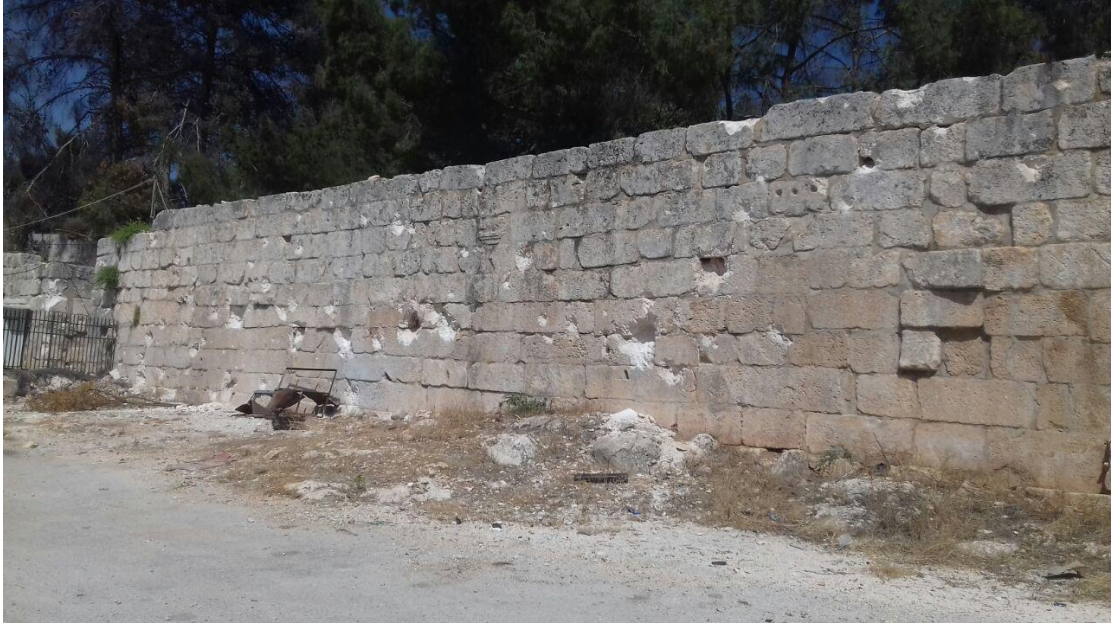
External wall damaged by shrapnel (photo facing southwest)