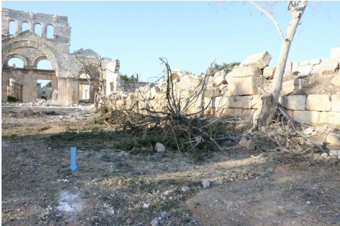
South façade of the Church of St. Simeon (Photo facing northeast)