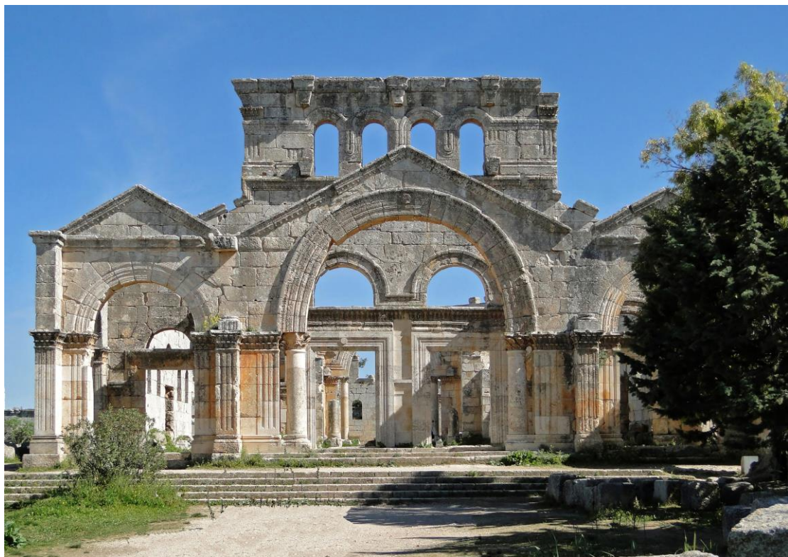
South façade of the Church of St. Simeon (prior to airstrikes)