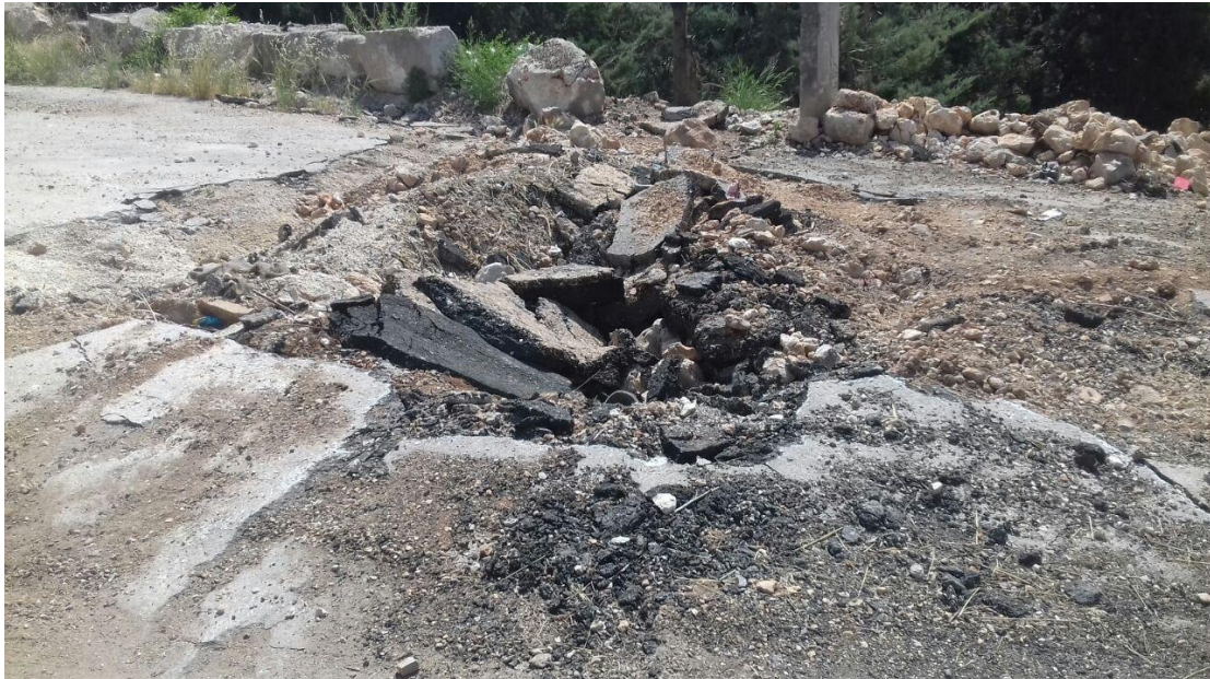
Damage to the road