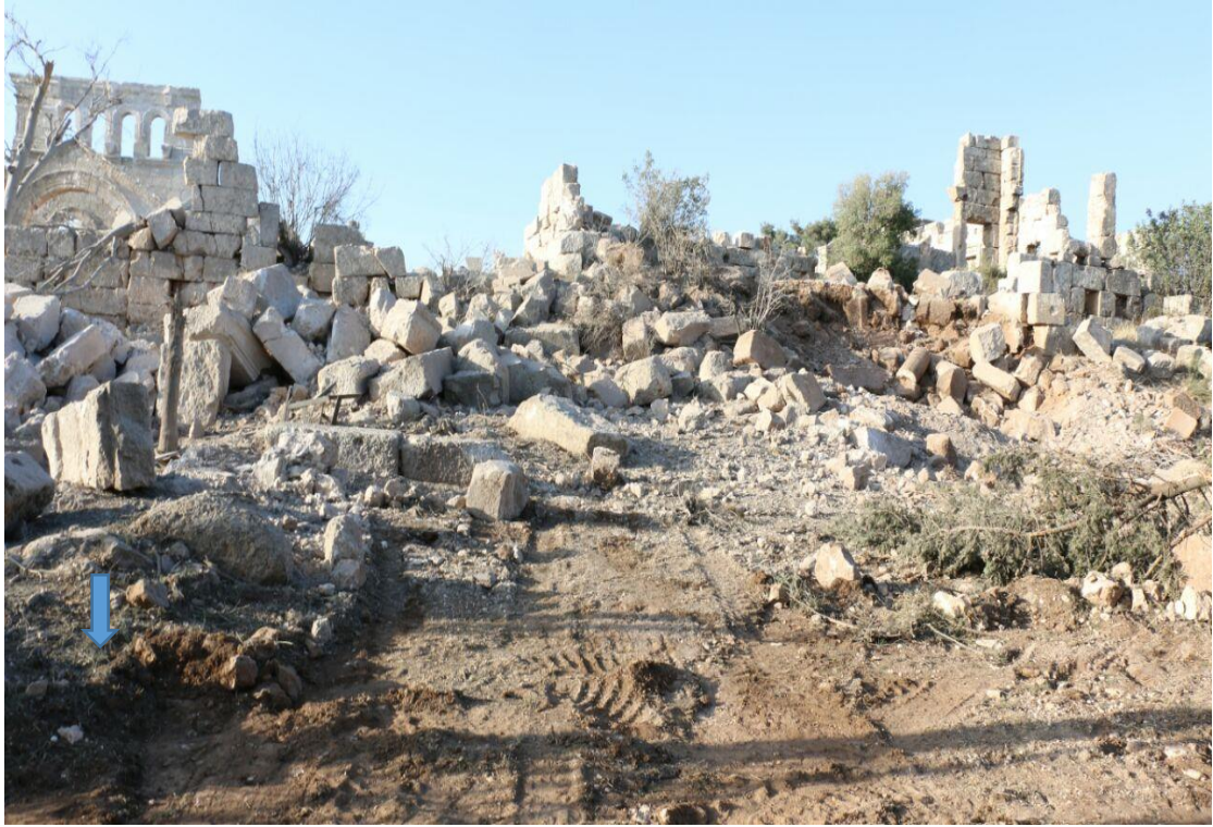
Extensive damage including collapsed and fragmented stone masonry (Photo facing northeast)