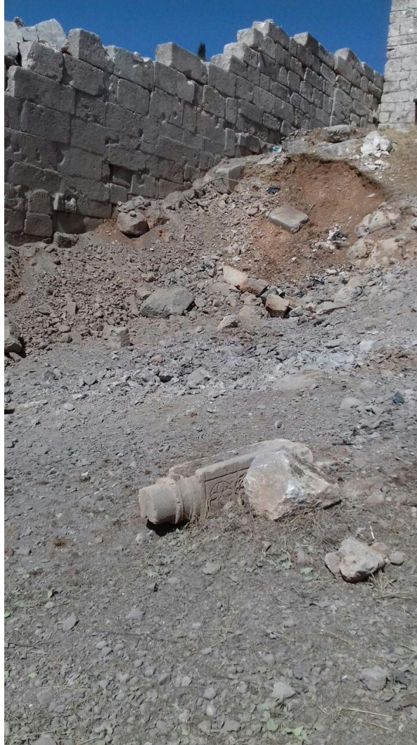
Northeast outer wall