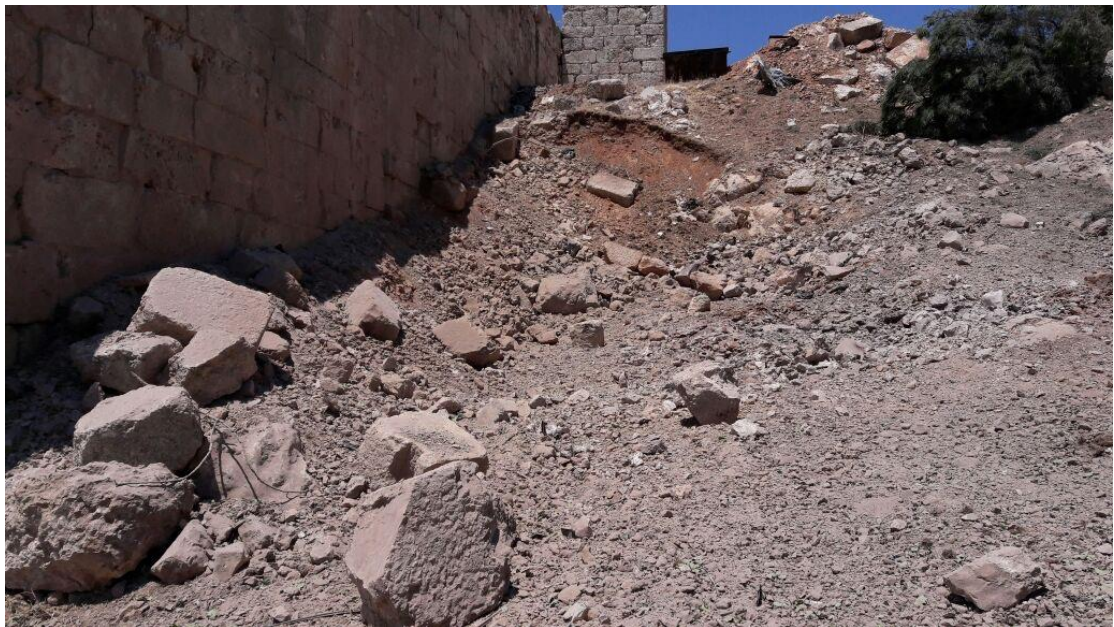
Damage to northeast outer wall