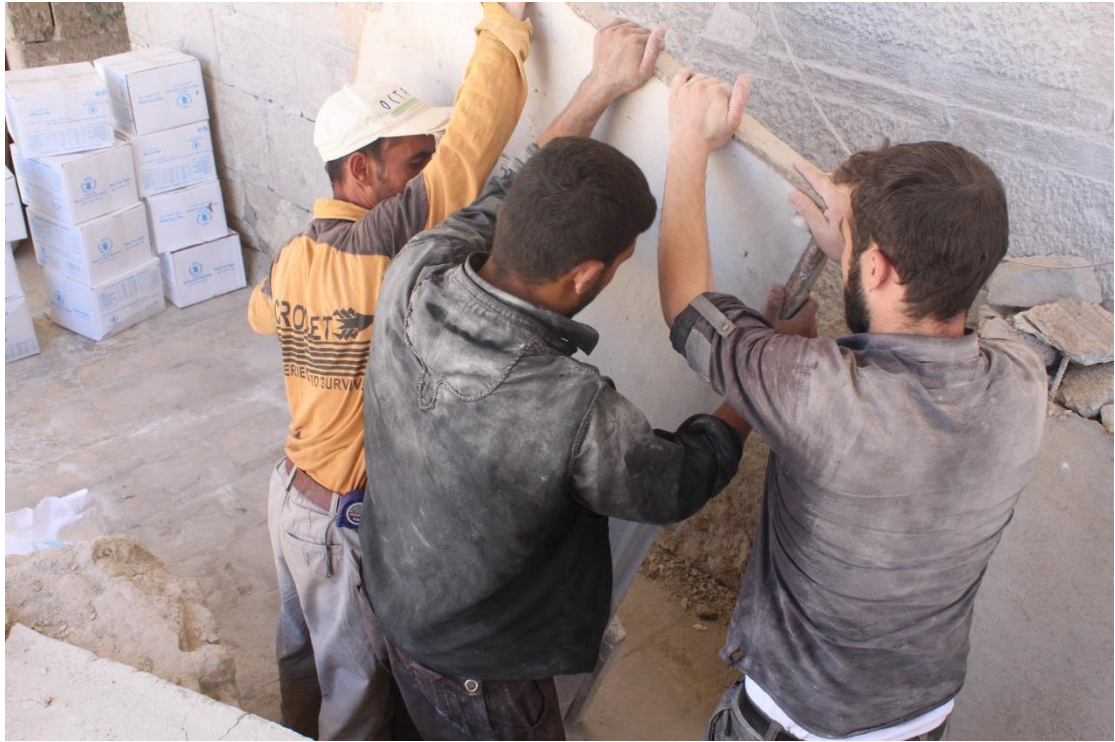
Preparing exposed mosaic for protection