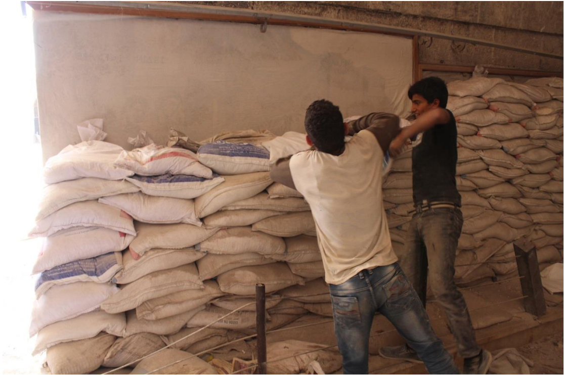
Sandbagging the cloth covered mosaic