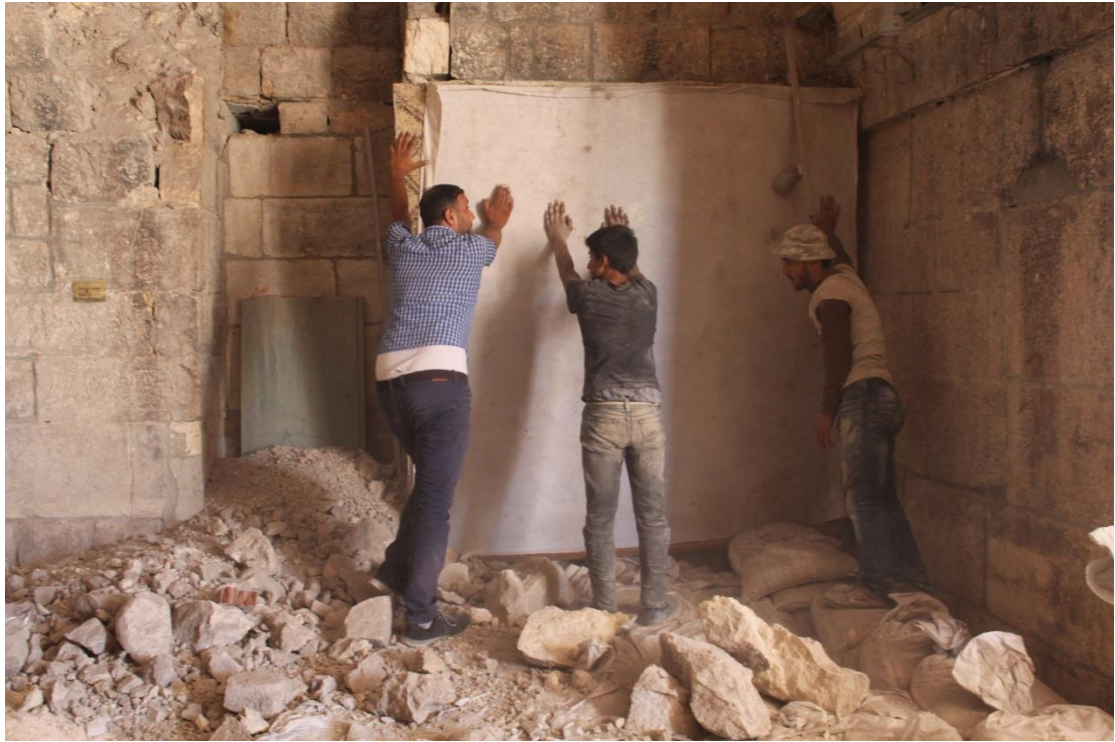
Restoring damaged stone burial tombs