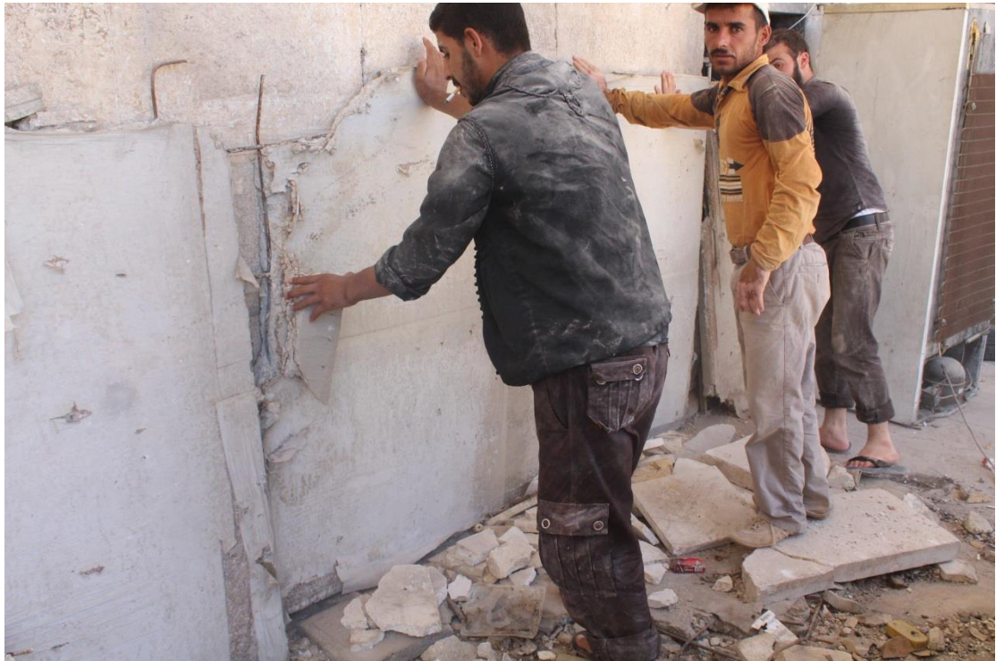
Moving the mosaics from the courtyard into the museum building