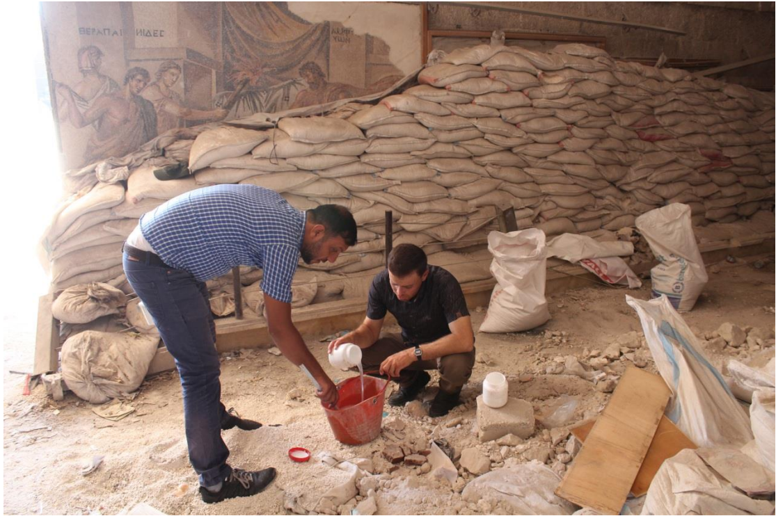
Covering mosaic with water soluble glue