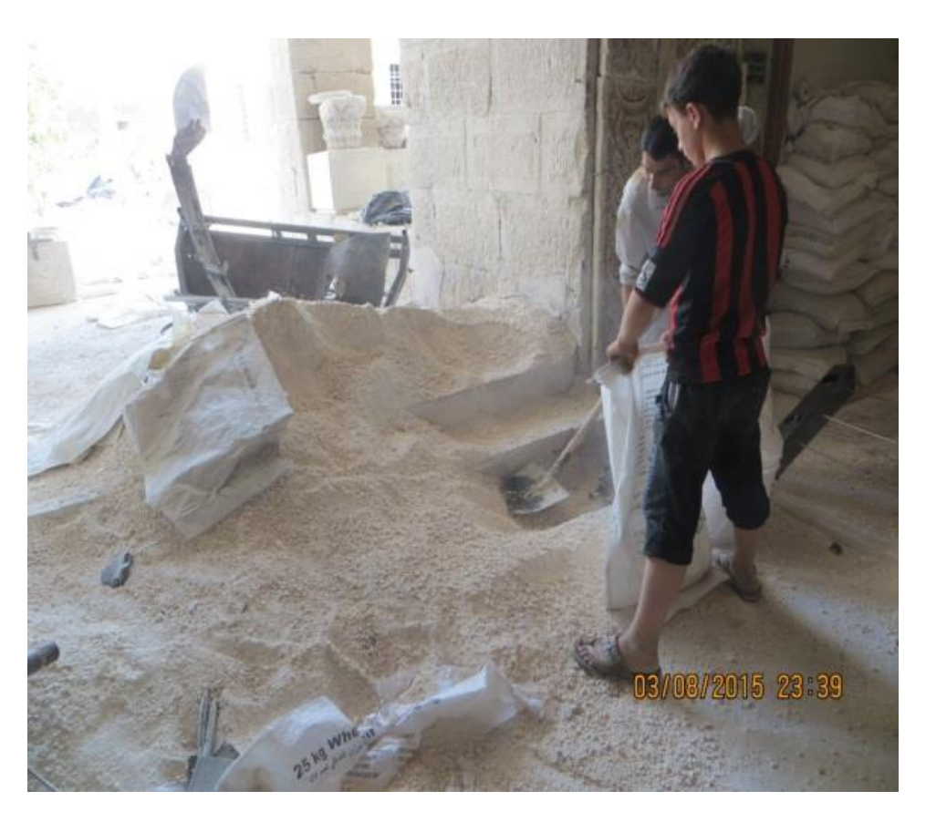
Laying down sandbags to protect mosaics