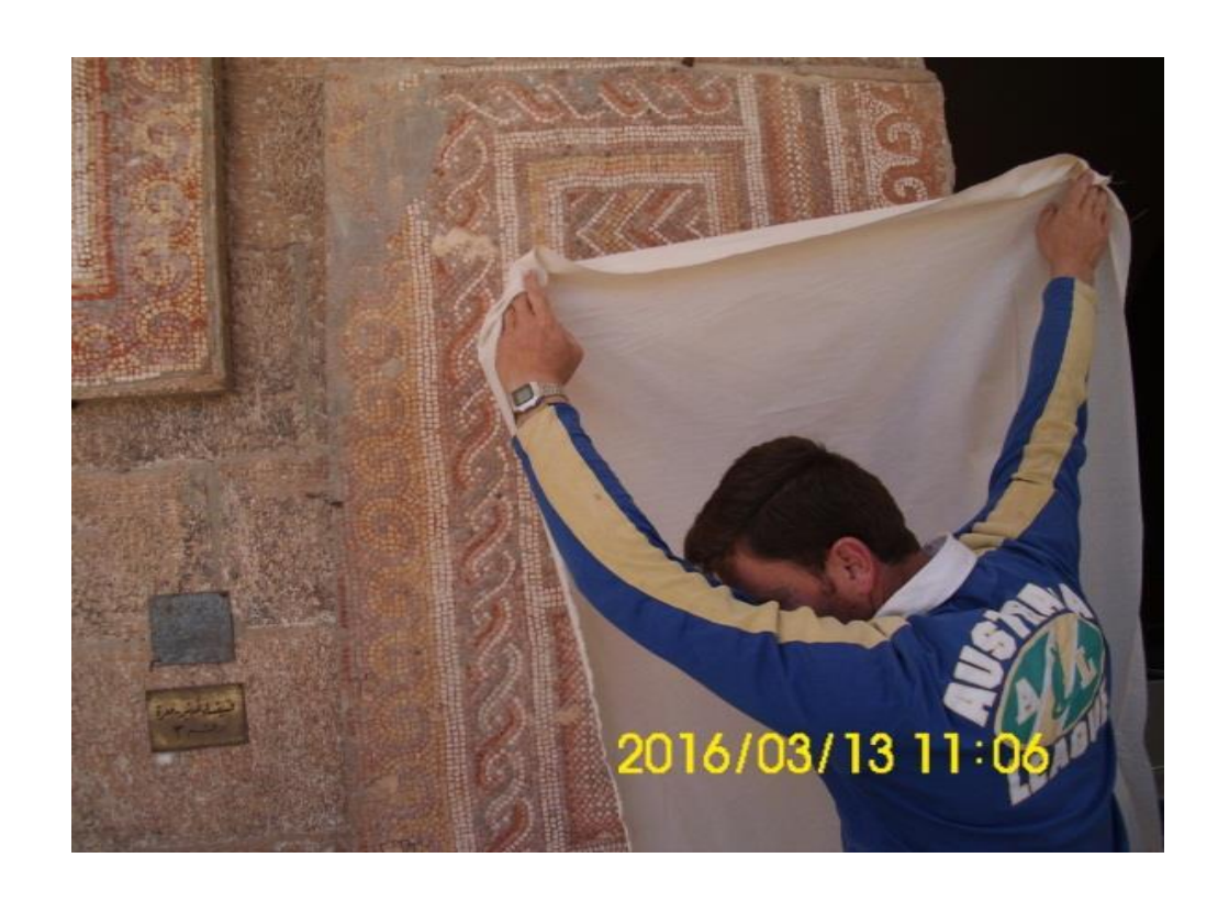
Covering the mosaics with TYVEK and white glue