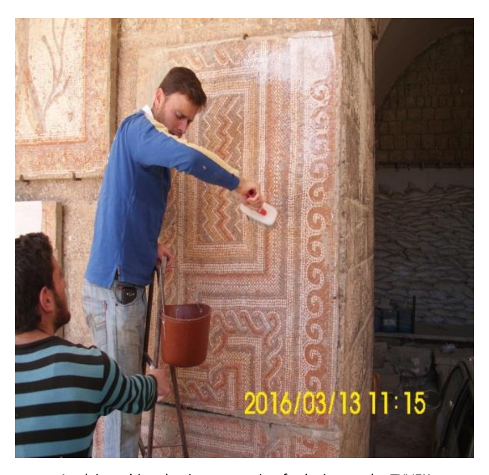
Applying white glue in preparation for laying on the TYVEK