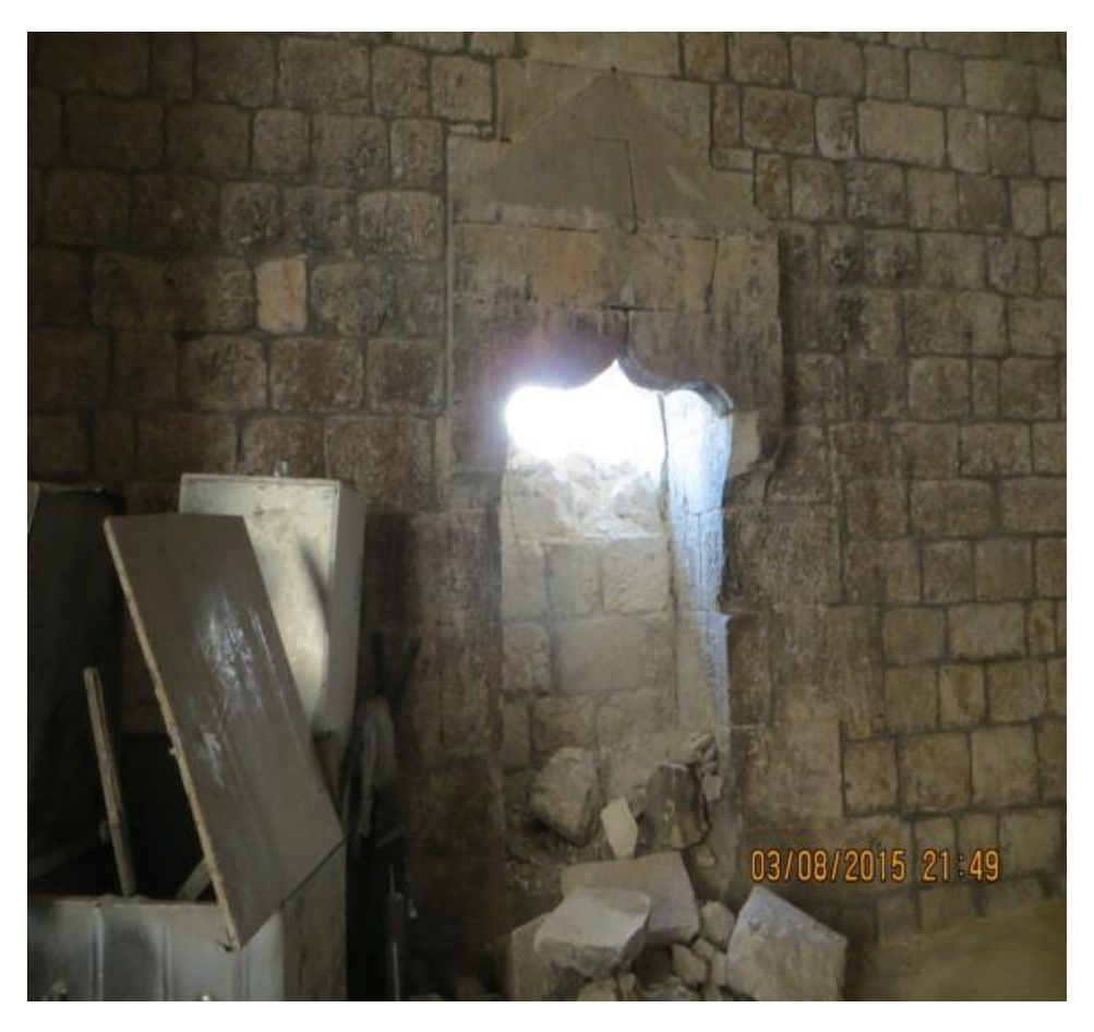
Repairing damage caused by a mortar shell